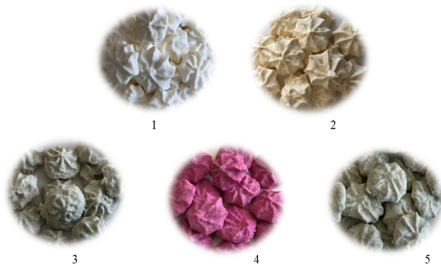
Figure 1. Yogurt bites: yogurt bites without plant raw materials (control) (1); yogurt bites with 1% rosehip fruit powder (2); yogurt bites with 1% nettle leaves powder (3); yogurt bites with 1% beetroot powder (4); yogurt bites with 1% mulberry leaves powder (5).

To prepare yogurt bites, Greek yogurt, plant raw material powder, fruit pectin, corn starch and maltodextrin were mixed in a mixer until a smooth mixture was obtained. The obtained yogurt samples of 7 mL of yoghurt were poured into silicone moulds and frozen to −36 °C overnight before being transferred to the freeze dryer. After 24 h, the samples were lyophilised using a Freeze-Drying Plant Sublimator 3'4'5 (ZIRBUS Technology GmbH,