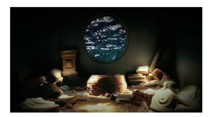
Figure 8. Eugènia Balcells, Exposure Time (still), 1989. Multimedia installation, Sound by Peter Van Riper.