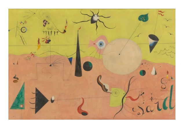
Figure 9. Joan Miró, The Hunter (Catalan Landscape), 1923–1924.