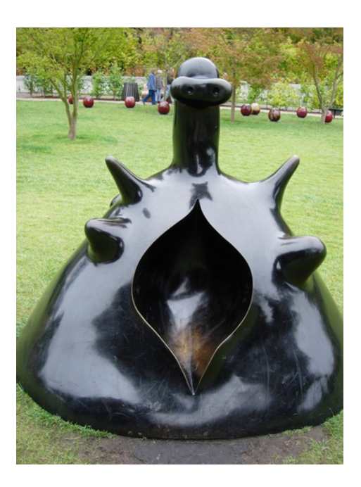
Figure 5. Joan Miró, Grande Maternité, 1973.

Similarly, Grande Maternité (Figure 5), Miró's bronze sculpture that is rounded with openings reminiscent of crowning during birth, robustly celebrates creation, the female form, and new beginnings. Miró created a number of these sculptures during the 1960s and 1970s, one of which rests in the sculpture garden of San Francisco's de Young Museum.