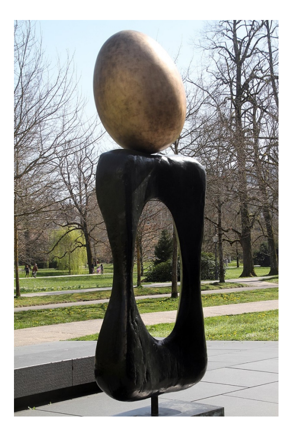
Figure 4. Joan Miró, Femme, 1970.

In Miró's sculptural work, the artist touches on themes of the egg. Well-known for his paintings, the artist has received less attention for his sculptures. Devoting time to sculpture later in life, Miró made his bronze "Femme" monuments (Figure 4), which have large central openings and egg-like heads made of golden-brown patina, all reminiscent of birth and creation. The form of the egg takes central stage in these sculptures.