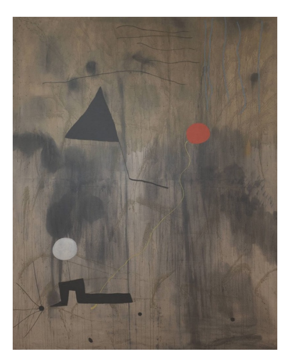
Figure 3. Joan Miró, The Birth of the World, 1925. Image in the Public Domain.

In Miró's sculptural work, the artist touches on themes of the egg. Well-known for his paintings, the artist has received less attention for his sculptures. Devoting time to sculpture later in life, Miró made his bronze "Femme" monuments (Figure 4), which have large central openings and egg-like heads made of golden-brown patina, all reminiscent of birth and creation. The form of the egg takes central stage in these sculptures.