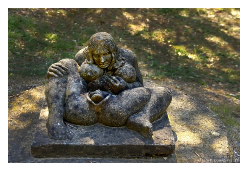
Figure 7. Xicu Cabanyes, Naixement de la mort (Birth of Death), 1980.

The Bosc de Can Ginebreda is a forest not far from Catalonia's northeastern city of Girona containing an open-air park with over one hundred sculptures created by Xicu Cabanyes (n.d.), a contemporary Catalan artist born in 1946. With a strong focus on the human body, some of the larger-than-life-size works found immersed along the paths, hills, and trails of the park are devoted to themes of birth, genesis, and coming into being. These themes are often overlooked in writings on Cabanyes' sculptures, which tend to emphasize the erotic or sensual nature of the artist's works. Images of death and mortality are also present in the sculptures, though frequently interwoven with those of birth. In a figurative work created in concrete, for example, the artist realistically depicts a skull of death that crowns from a birthing woman (Figure 7).