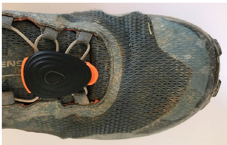
Figure 3. The Stryd sensor fixed on the right shoe of one of the participants.

The STP which are SF, GCT, VO as well as Kleg were measured simultaneously by Stryd (Stryd Inc. Boulder CO, USA). The Stryd (Figure 3) is a carbon fiber reinforced pedometer that is attached to the laces of the shoe and weighs 8 grams. A single sensor was attached to the right foot of each participant at the lowest point of the shoe area. Based on an inertial measurement unit (IMU), 6 axes (3-axis gyroscope, 3-axis accelerometer), it provides data to quantify P, SF, VO, Kleg, pace, distance, and elevation during running. Some studies have already examined its validity and reliability for measurement of STP [16,19,24,29].