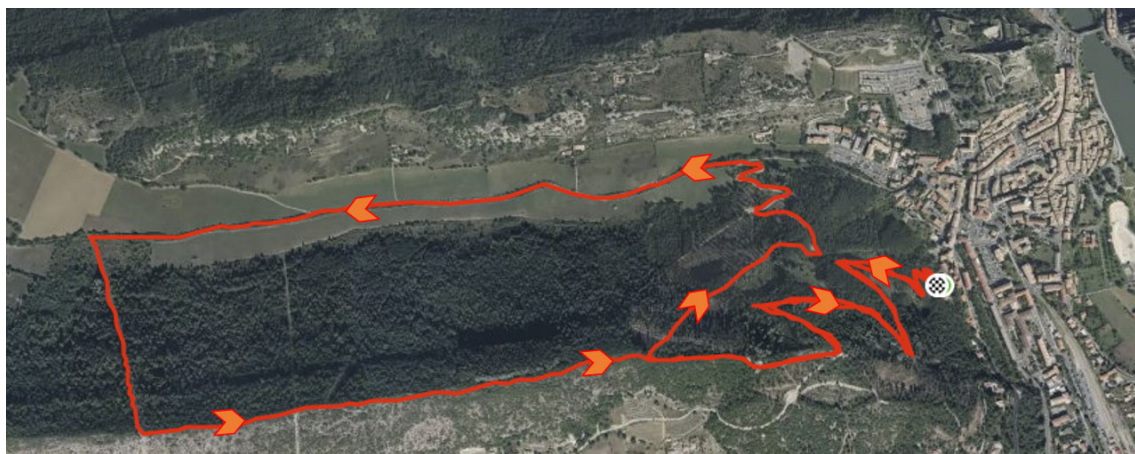
Figure 2. Satellite view of loop.

Visual markers were placed at the beginning and end of each section (i.e., UH1, UH2, DH1, DH2, and R). This was used as indications for the riders thus that they could perform manual laps on the GPS, used for later analysis. The only instruction given to riders before the test was to complete the loop as fast as possible, as if they were in real race conditions. Prior to the start of the test, all subjects had to complete their usual “pre-competitive” warm-up. Depending on the habits of each participant, the warm-up consisted of a slow run on the flat or uphill. Exercise routine, knee lifts and butt heels etc. were also part of the warm-up. Then 2 to 5 accelerations for 20 to 30 seconds were performed. On average the warm-up “time” was between 5 and 15 minutes depending on the subjects’ preferences.