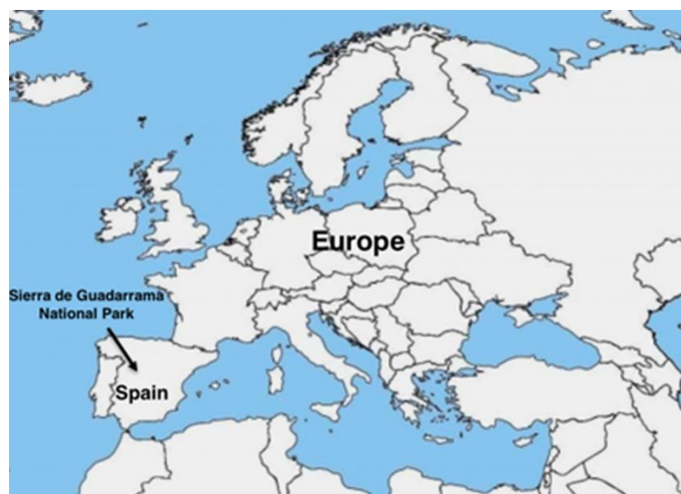
Figure 1. Sierra de Guadarrama National Park location.

The Sierra de Guadarrama National Park occupies 33,960 hectares, and is located in the mountain range of the Central System (Figure 1), forming part of the natural division between the northern and southern plateaus that make up the center of the Iberian Peninsula (Spain and Portugal). In addition, its peripheral protection zone is 62,687.26 hectares (this has its own legal regime, designed to promote the values of the park in its surroundings and to minimize the ecological or visual impact of the exterior over the interior of the park), and its legal area of socioeconomic influence is 175,593.40 hectares (Figure 2)—the total area of the municipalities where the National Park and its Peripheral Protection Zone are located [22].