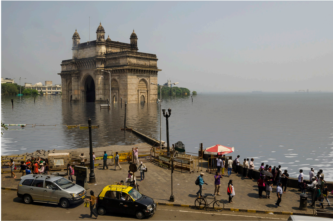
Figure 4. Climate Central's image of Mumbai at 2 °C of warming.