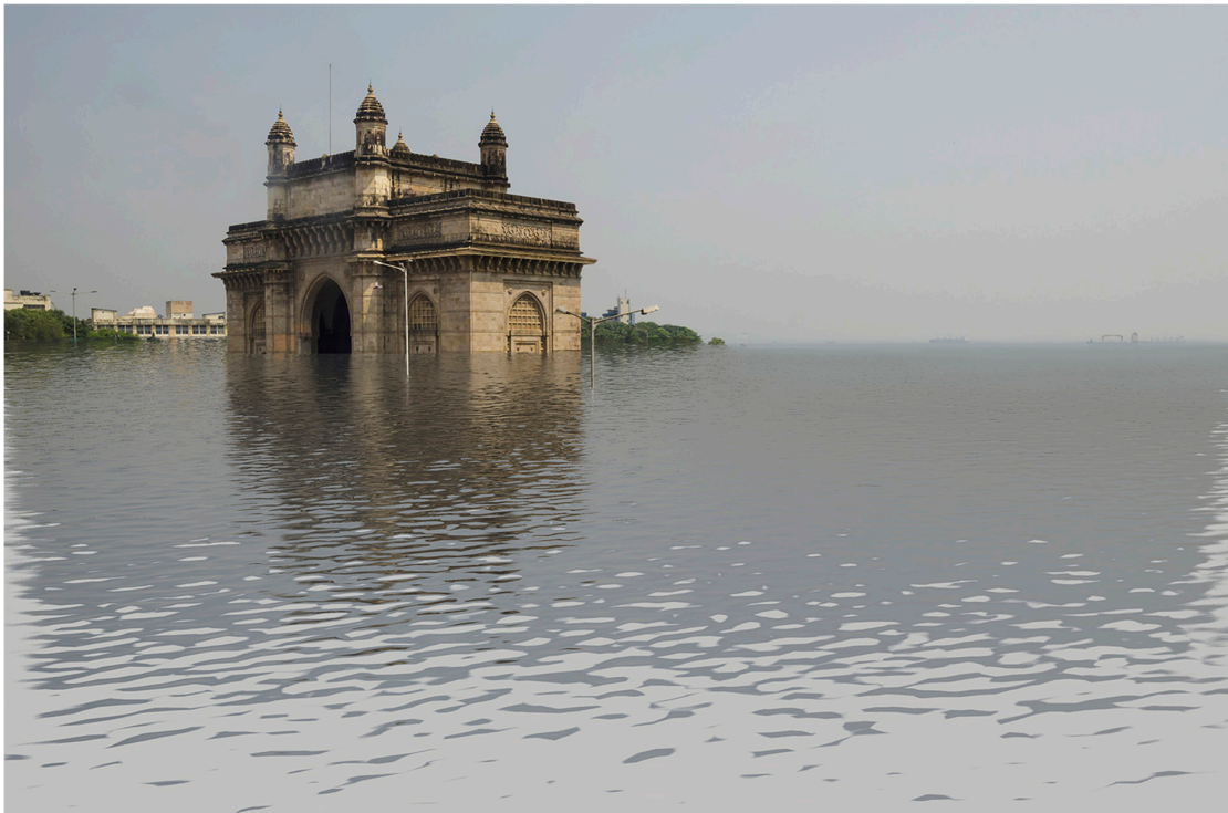
Figure 5. Climate Central's image of Mumbai at 4 °C of warming.