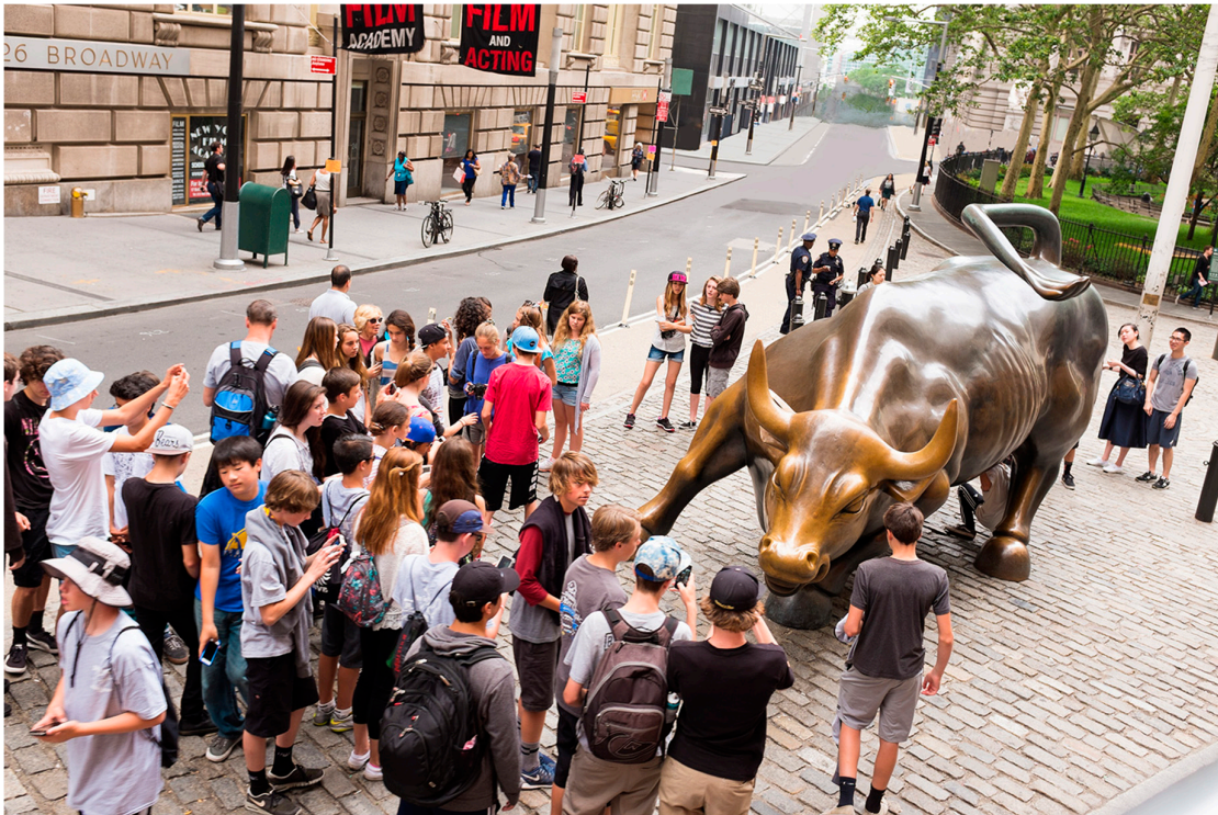
Figure 2. Climate Central's image of New York City at 2 °C of warming.

be gainsaid. However, management of the climate crisis is impossible without a catastrophist reckoning. To the extent that mainstream climate policy discourse suppresses catastrophist thinking, it enables our continuing climate delusion and runaway emissions.