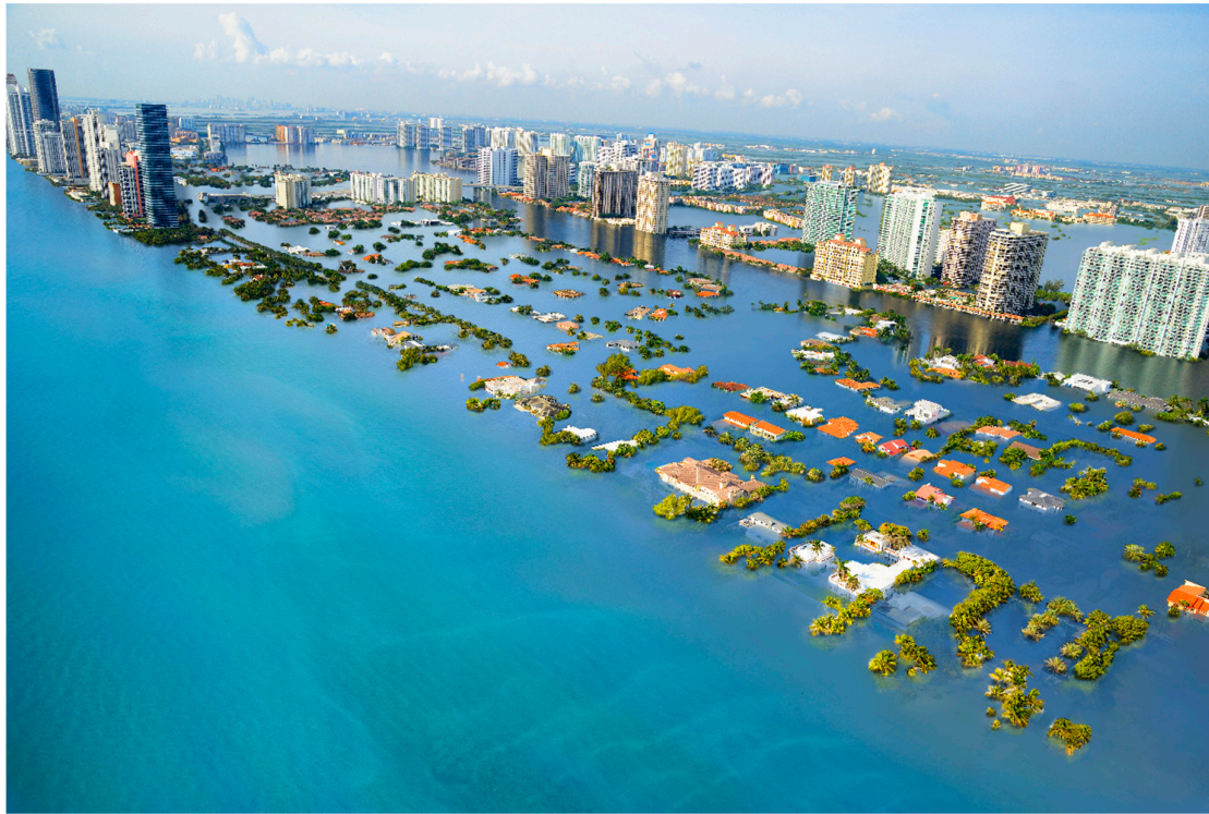
Figure 1. Climate Central's depiction of Miami at 2 °C of warming.

coastline overlaid by a flood line at a specific temperature increase—2 °C—which will certainly be exceeded, but with that 2 °C timeline extrapolated beyond the present century (Levermann et al. 2013). In other words, the complexity of climate models, it turns out, translates imperfectly to a single, spectacular image.