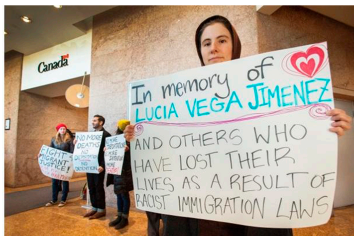
Figure 1. 2014. Protesters outside Vancouver’s CBSA Offices demanding inquest.

What can be said of this loss? Being in contact with community and advocacy groups who knew Lucía; many insist that her story needs to be publicly examined and told ( Walia 2014 ). The protesters who brought a box full of 7500 signatures to Vancouver’s CBSA Offices, as pictured below (see Figure 1), demanding an inquiry into the death of Lucía clearly held this view.