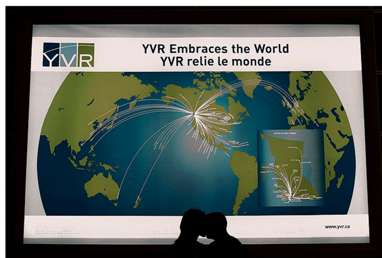
Figure 3. Promotional Poster at the Vancouver Airport.