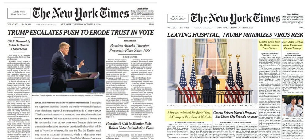
Figure 4. Front pages of The New York Times in October 2020, replicating tweets from Trump.

The link between traditional media and the messages of a populist leader on a social network provides evidence of the hybridization of the current political landscape. Trump used Twitter as his main communication channel, but the propaganda mechanisms did not remain on social media; rather, they moved to the quality press. Most of the front pages of the sample applied this type of propaganda label, which should trigger a deep reflection on the amplified role of legacy media in far-right populism.