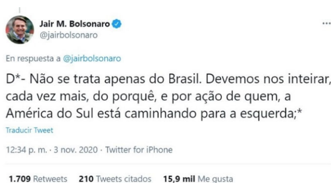
Figure 2. Tweet from Bolsonaro using the horse race frame.