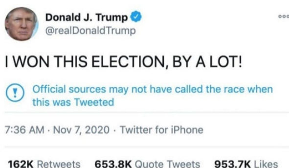
Figure 3. Tweets from Trump appealing to emotion and stating opinions as facts.

The other populist leaders also showed interesting divergences, although most of them shared the application of emotions and opinions. For instance, Bolsonaro frequently presented opinions as facts (38.9%) as well as attributions (29.6%). The latter are common in game frame approaches since they emphasize the successes and failures of political actors. Le Pen showed a strong preference for information selection (27.5%) and appealing to emotion (49.6%). These two practices were also carried out by Trump. It must be noted that Le Pen is the only leader who rarely published opinion-based messages as factual (0.8%).