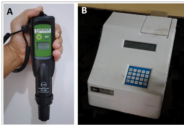
Figure 1. (A) FluoroSense™ handheld fluorometer and (B) TD-700™ fluorometer.

We tested for differences in the measurements between the FluoroSense probe and the TD-700 fluorometer (Figure 1) under different environmental conditions using water samples from two urban, manmade lakes in Tucson, Arizona, USA (Figure 2). Lakeside Lake (5.7-hectare surface area at 32°11'10.1" N 110°48'58.8" W) and Silverbell Lake (5.3-hectare surface area at 32°17'05.0" N 111°01'55.0" W) both receive moderate recreational and fishing use and are fed by groundwater pumped to the surface via wells. The well that supports Silverbell Lake is influenced by treated wastewater recharge in the nearby effluent-dependent Santa Cruz River [21], and Lakeside Lake also receives episodic runoff from Atterbury Wash, an ephemeral urban stream.