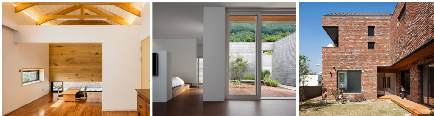
Figure 6. Examples of Residential Spaces with Stability of Dwelling (Source: "Space" magazine).

and plain materials of achromatic color make the landscape stand out more clearly, while bringing the interior into a static state" [62].