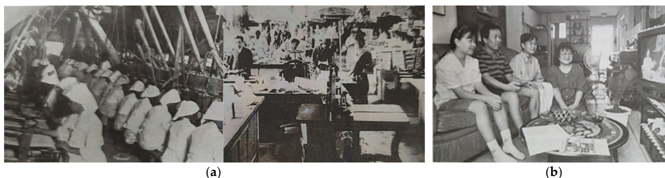
Figure 2. (a) Women working at a rice mill and men at a printing plant; (b) Watching TV with the whole family at home [35].

These changes brought about the separation between the home and society and between the house and the city. The biggest change was in the function of the home and society. In traditional society, it was natural that individual life and social activities were mixed in the dwelling, but the modern urban structure, which was formed in earnest during the Japanese colonial period, has changed to a dichotomous structure with a clear boundary between public and private space. In the past, there was no public space, a place of gathering and entertainment; therefore, social contact—gathering and interacting with each other—was limited to residential spaces and their surroundings. However, as urbanization progressed in the tide of capitalism, production space, commercial space, and leisure space began to emerge, and much of the activities that were conducted in and around the residential space moved to the urban space. As a result, in contrast to the public space, family togetherness is now recognized as the most important function in the residential space, and the residential space has become a private space as opposed to a public space. A home is a place to rest after returning from work, and housing's most important function is now providing a resting place. The residential space where all life activities used to take place in the past has now become a place only for the simple functions of family togetherness and rest [34].