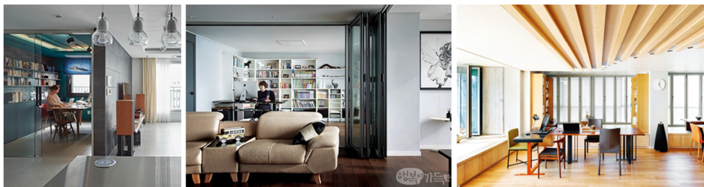
Figure 3. Open workspace with soft boundaries and visual connection.

Open workspaces or transparent yet adjustable boundaries are also linked to the possibilities of multi-spaces for families. In a prior study, we discussed changes in the "characteristics of residents" and the "relationship between individual and family" in contemporary society. There were many cases where residents had a wide variety of professional hobbies related to the field of culture and art even in their jobs not directly related to art,