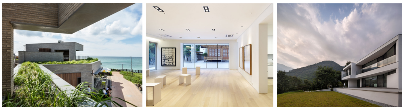
Figure 5. Examples of Residential Spaces that Pursue the View (Source: “Space” magazine).

The sequence accompanies the movement of the body. While moving your eyes, turning your head, and moving your body, you make the same landscape feel different depending on where you stand according to the subtly curved angle and protruding part of the space, as in the following case: “Nonetheless, Yoon’s view does not come down to one ‘picture’. The walls, ceiling, and floor tug and pull at each other in a subtle way so that framing a view is not possible. The vertical and horizontal surfaces almost never meet at a single point. They always criss-cross and create movement” [16] (Figure 5, right). As