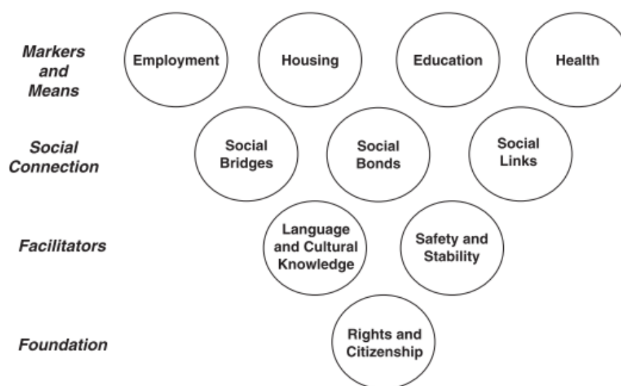
Figure 1. A conceptual framework defining core domains of integration. Reprinted from ref. [21].

This study uses Ager and Strang's [21] successful integration framework. This framework includes ten core domains of successful integration, which are divided into four areas: markers and means (employment, housing, education, and health), social connections (social bridges, social bonds, and social links), facilitators (language and cultural knowledge, safety and stability), and foundation (rights and citizenship). Figure 1 shows the connections within the core components of integration in Ager and Strang's conceptual framework (2008).