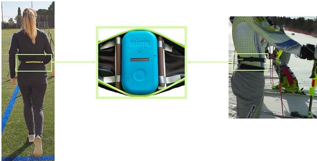
Figure 2. IMU device fixed on the athlete/skier's lower back, at the L4–L5 level using an adjustable sports lycra belt.

In both experiments, an IMU device (WIMU, Realtrack Systems, Almeria, Spain) weighing 70 g and with a size of 81 \times 45 \times 15 mm was attached to the lower back of athletes and skiers, at the L4–L5 level, using an adjustable sports lycra belt (Figure 2).