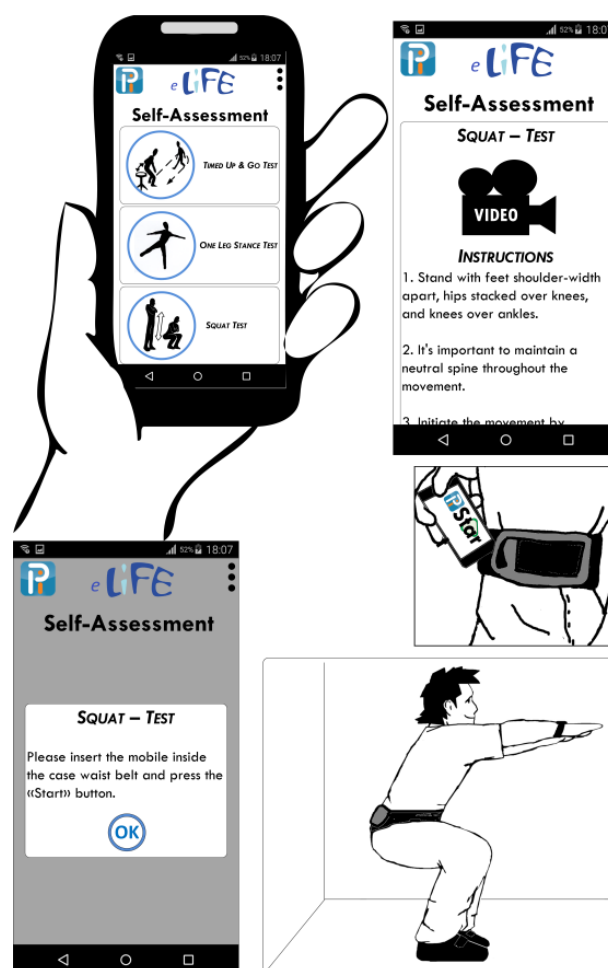
Figure 2. Example of a self-assessment test application for physical performance performed while having a smartphone worn in a belt around the waist. From a smartphone application different tests of physical function can be chosen, demonstrated through a video clip, and instructed by use of a virtual instructor.

Use of wearable technology offers new solutions for self-assessment of physical performance and behaviour, which, so far, to a large extent, has been assessed by professionals using a variety of clinical tests. Several test applications for use by health personnel, with wearable sensors or smartphones fixed to the body (e.g., the lower back), have already been developed, such as instrumented versions of the commonly-used clinical test Timed Up-and-Go [46]. Using sensors embedded in the smartphones, detailed information about movement quality, as well as quantity, can be gathered. For the purpose of self-assessment, information from accelerometer and gyroscope sensors may be used to provide feedback to users about correct performance of test items. In PreventIT we aim to develop a self-assessment test battery for physical performance using smartphones worn on the body both for testing and to measure performance. For example, while performing squats, the information from the sensors may identify whether a person bends the knees and hips deeply enough. Figure 2 shows how a physical performance test application with a smartphone worn in a belt and fixed over the lumbar spine may be used to instruct and record performance of test items.