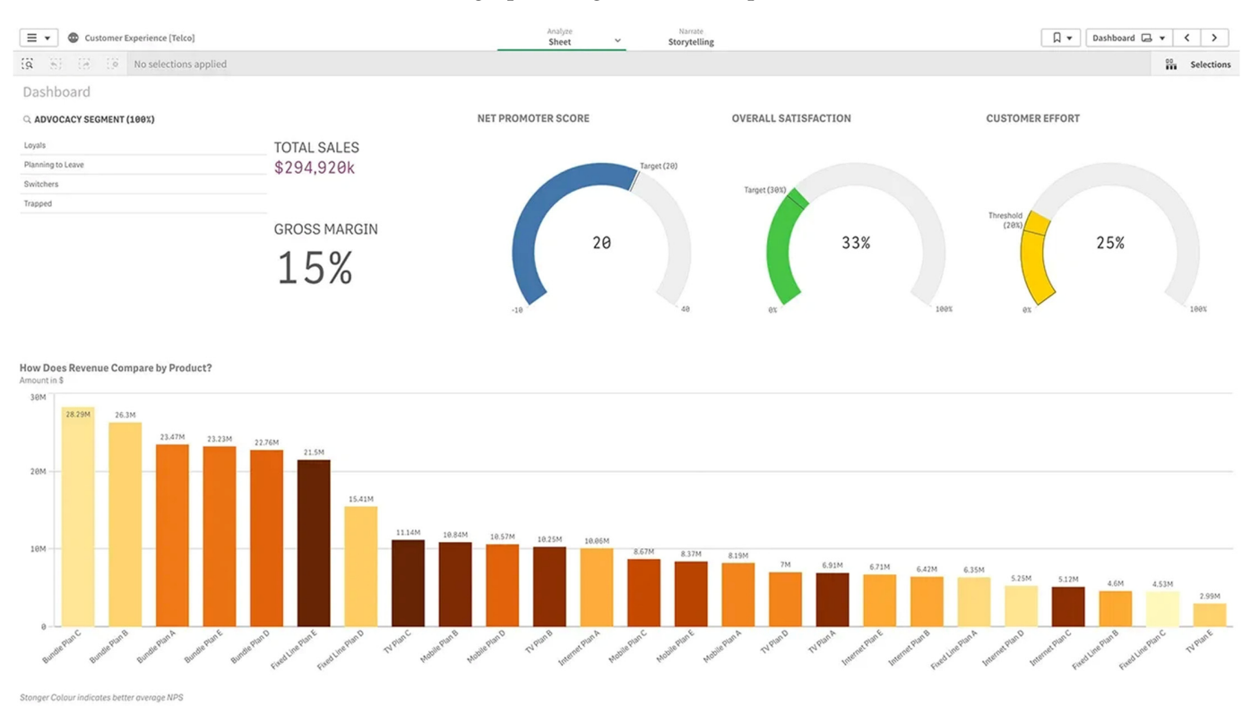
Figure 1. Dashboard showing company sales [5].

A dashboard is a visual tool that is designed to convey key information in a concise manner on a single screen that can be quickly interpreted by the user or "at a glance". Figure 1 shows an example of a dashboard showing revenue for a company. Dashboards first appeared in the early 1990s, having been of interest to researchers by providing a means of summarising important information and visualising it with graphical components such as charts, graphs, diagrams, and maps.