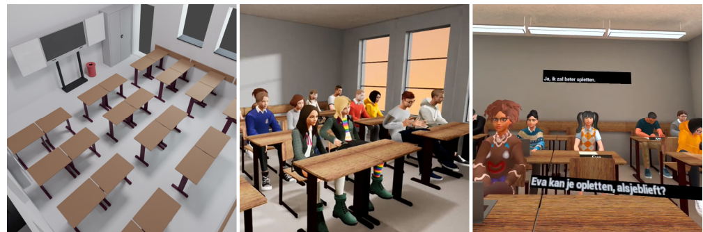
Figure 4. Different stages in the development of the VR application. From left to right: 1. Empty classroom, 2. Full classroom with non-interactive virtual students, 3. Classroom with verbally interactive virtual students and interaction based on OpenAI.

During tests, we found that trainees easily adapt to the movement controls. The trainee's height was standardized at 1.70 m. The virtual classroom is shown in Figure 4.