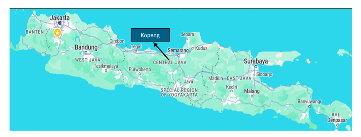
Figure 1. The Kopeng Agropolitan Area in Central Java, Indonesia.

where Y: logarithm of organic cabbage production; LnLA: natural logarithm of land area; LnSd: natural logarithm of seeds; LnOF: natural logarithm of organic fertilizer; LnOP: natural logarithm of organic pesticides; LnLb: natural logarithm of labor; b_1 – b_5 : value of coefficient; and e: error term.