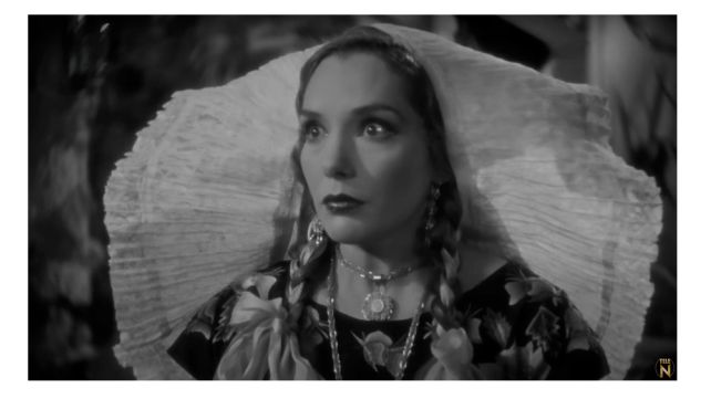
Figure 4. Lupe Velez in La Zandunga (1938). Screen capture from clip. Clip | Tele N. https://www. youtube.com/watch?v=gJiBZIdzBEQ. Accessed on 1 September 2023.

The image of the Tehuana and her traje (regalia), for instance, was incorporated into the insurgent national identity through film and printed media. Non-Indigenous women began wearing the emblematic traje and were featured in postcards, posters, magazines, and movies as markers of Mexico's pre-colonial past. One of the most notable examples is Hollywood star Lupe Velez, who personified a Tehuana in the popular film La Zandunga (1938), directed by Fernando de Fuentes (Figure 4). Scholars such as Francie Chassen-López and Alexa Matta-Abbud have concluded that this popularized image of the Tehuana, however, was constructed for a male gaze that not only exoticized Zapotec women but also essentialized and mythified their famous clothing (Abbud 2021, pp. 86–106; Chassen-López 2014, pp. 281–314). As a former ballet folklórico dancer, I myself wore the traje to perform the cuadro de Oaxaca , the dance suite representing the region. I was not aware at the time, regrettably, of how the Tehuana and her image had been appropriated for decades by elite Mexicans. My current artistic work addresses such issues of cultural travesty—which I will describe later.