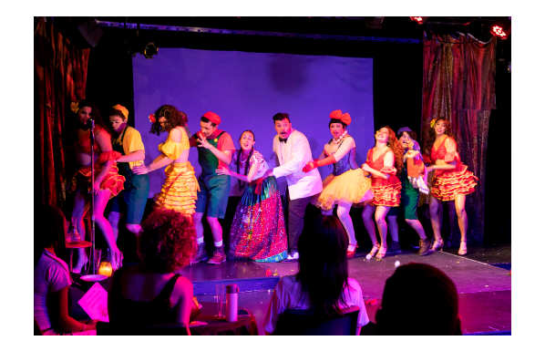
Figure 2. The cast of La Liga de la Decencia . April 2023.

One night, as the cabaret is booming with a lively audience, the emcee begins hearing and seeing strange images and sounds depicting a mix of cartoons, forbidden films showing nudity, and nationalist propaganda. The show turns into a search to find whoever is causing the interruptions. Through a final monologue, the emcee reveals truths about himself while urging the audience not to leave him, as La Liga de la Decencia, an organization that polices people's behavior, is bound to apprehend him (Figure 2).