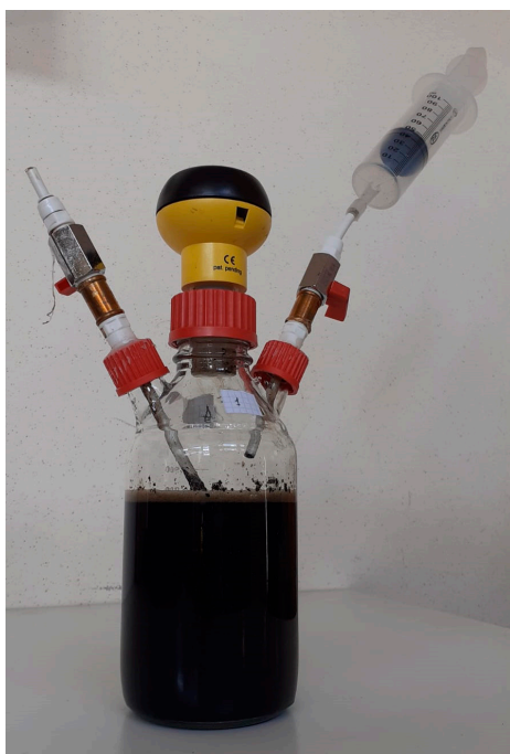
Figure S2. Semi-continuous anaerobic reactor