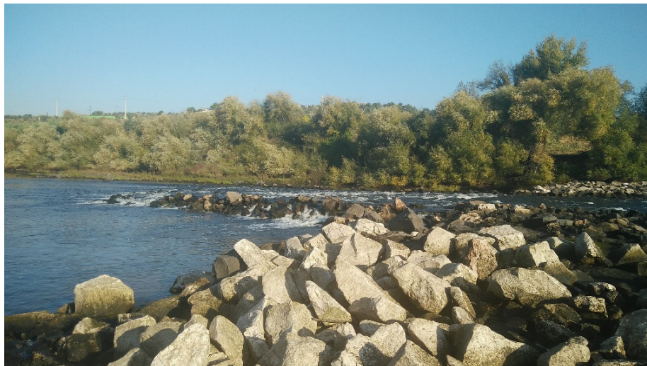
Figure S1. Fish ramp (20 m long, 4 m wide, 23 m elevation, 2.5% longitudinal slope), at the right margin of the Tagus River, incorporated in the Pego weir. Picture retrieved following the study by Ferreira et al. [41].