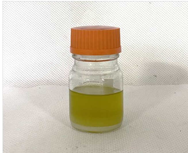
Figure S3. Photographs of (a) BSFL lipid and (b) Hydrotreated BSFL oil.