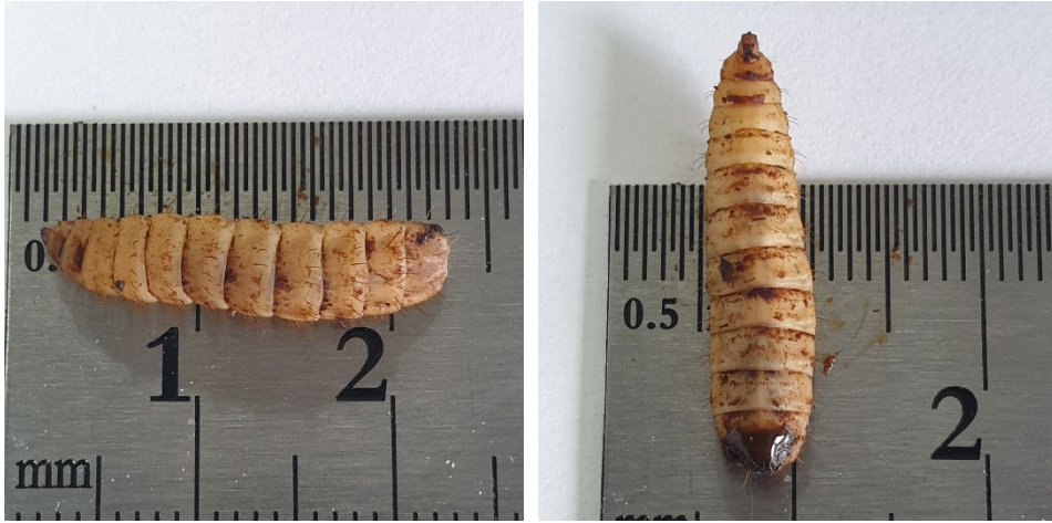
Figure S1. Photographs of Black soldier fly larvae ( Hermetia illucens )