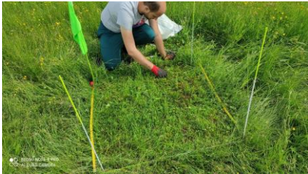
Figure S3. Careful and complete collection of biomass from the test plot