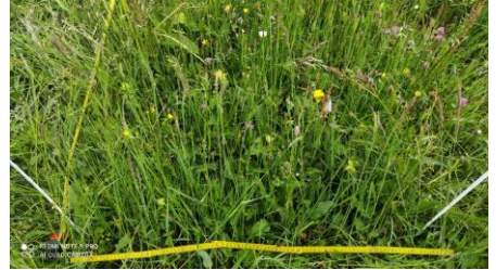
Figure S2. Measurement of test plots