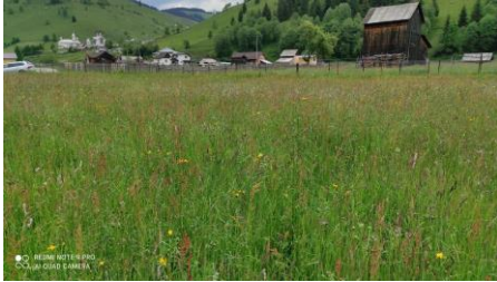
Figure S1. General view with investigated meadow