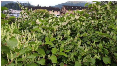
Figure S6. R. japonica , installed on a meadow near Vatra-Dornei.