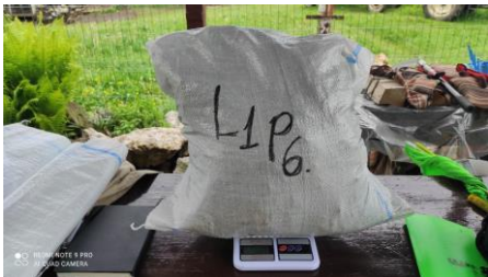
Figure S5. Total green weighing of the sample obtained from the test square