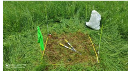
Figure S4. Completion of biomass collection from the test plot