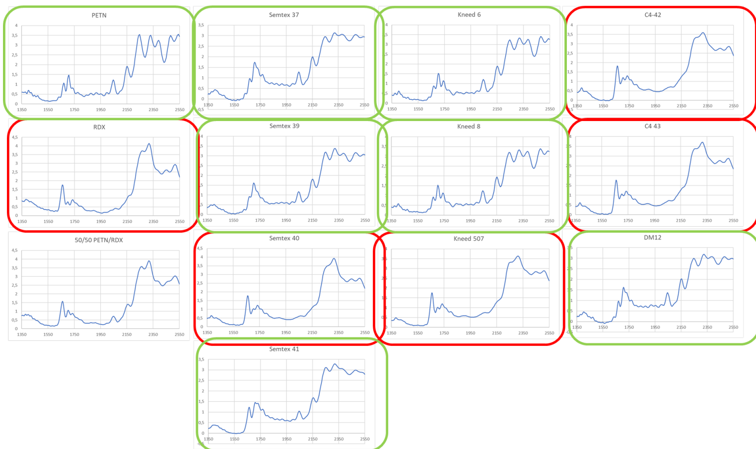
Figure S3. Typical NIR spectra of PETN-RDX based plastic explosives from the collection of TNO