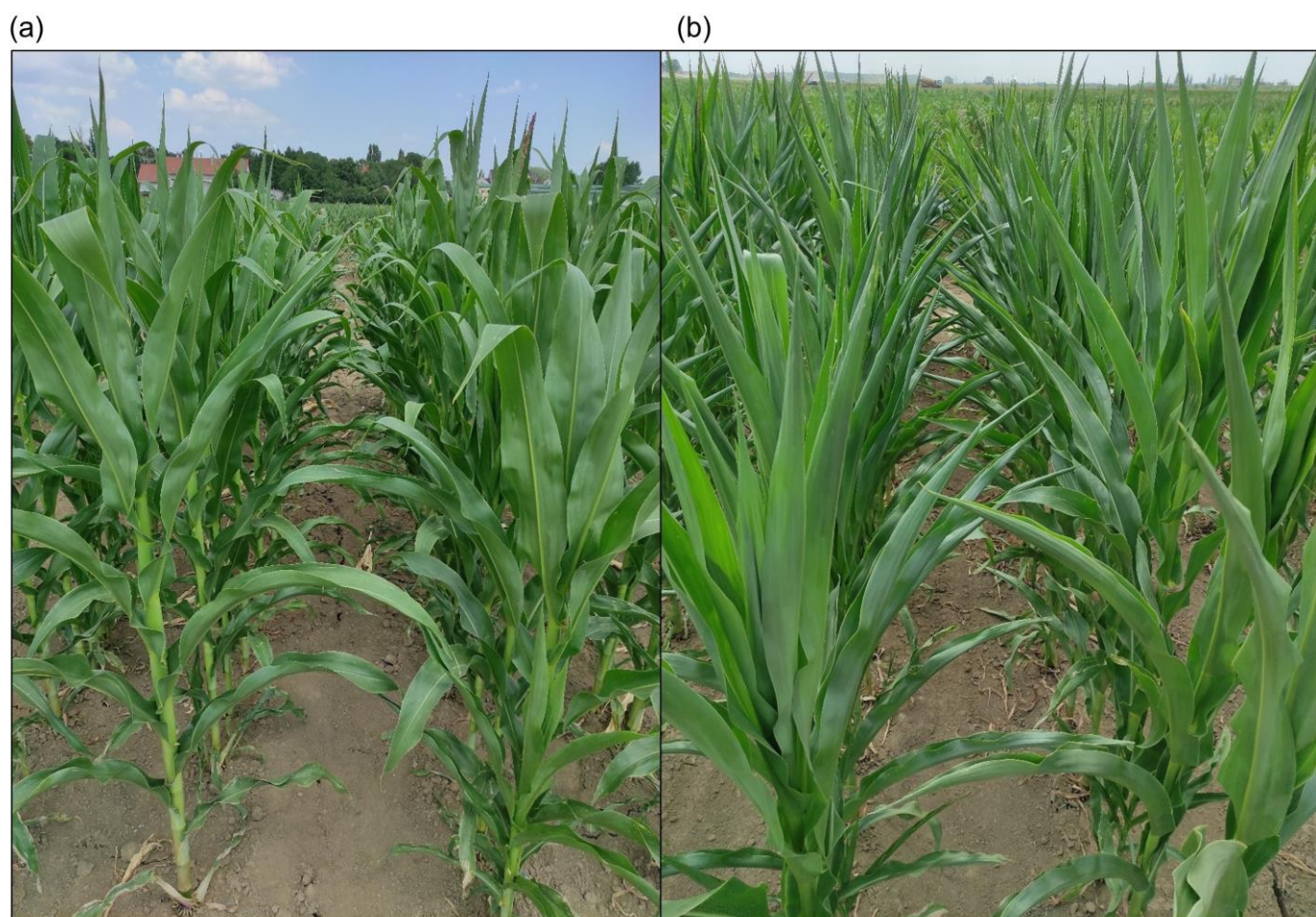
Figure S1. (a) Maize plot showing no leaf rolling (LR-) and a plot with leaf rolling (b)