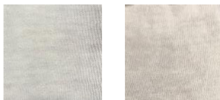
Figure S2. Cotton substrates functionalized with 0.1 mg/mL AuNPs. Left: Exhaustion with surfactant A + surfactant D; Right: Exhaustion with surfactant B + surfactant D.