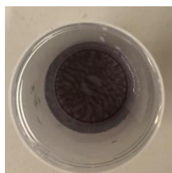
Figure S3. Master dispersion with AuNPs and Surfactant B + surfactant D.