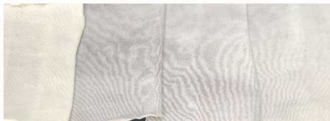
Figure S4. Samples functionalized with different RB (exhaustion with 0.1 mg/mL of AuNPs and 4 g/L of surfactant A, at 60 °C for 60 min). From left to right: Control sample without NPs; exhaustion with 20:1 ratio; exhaustion with 12:1 ratio and exhaustion with 7:1 ratio.