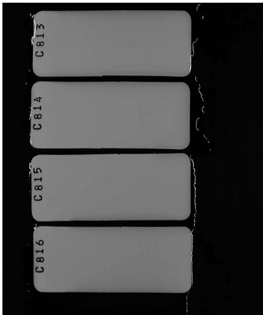
C813: CDK male C814: CDK female