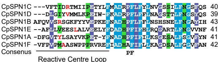
Figure S3 Comparison of protein sequences encoded by serpin1 in several lepidopteran insects. (A) Sequence alignment of conserved region of serpin1 proteins in Mamestra configurata , Bombyx mori , Manduca sexta , Plutella xylostella , and Cydia pomonella . The hinge region preceding the reactive center loop (RCL) showed almost identical residues (in blue background) and similar residues (in green or purple background) were also indicated. (B) Alignment of C. pomonella serpin1 carboxyl-terminal inhibitor domain variants following the hinge region with the RCL and P1 positions are highlighted in red.