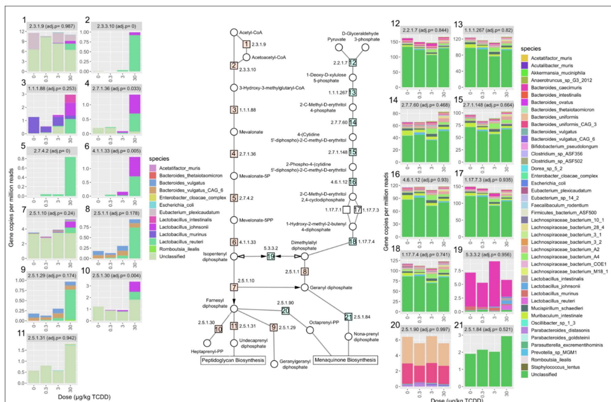
Figure S1. Stacked bar plots of annotated EC number mean relative abundance and classified species involved in isoprenoid biosynthesis in cecum of TCDD-exposed mice. Male C57BL6 mice were orally gavaged with sesame oil vehicle or 0.3, 3, or 30 µg/kg TCDD every 4 days for 28 days (n=3). Numbers beside each bar plot correlate with numbered EC number provided in the center schematic of isoprenoid biosynthesis. Adjusted p -values (adj. p ) were determined by the Maaslin2 R package.