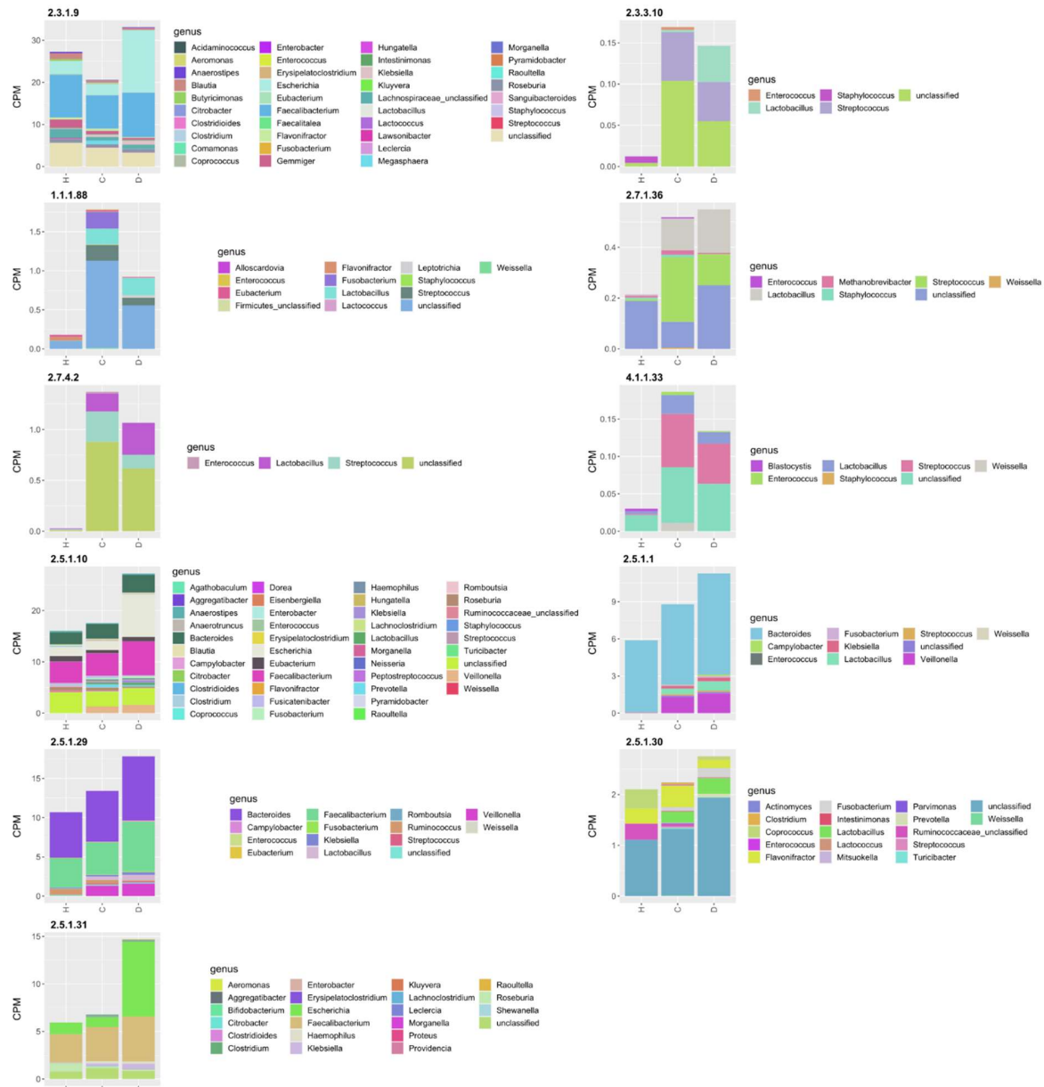
Figure S3. Stacked bar plots of annotated EC number mean relative abundance classified to respective genus and involved in mevalonate-dependent isoprenoid biosynthesis in cirrhosis patients. Fecal metagenomic samples were from healthy (H, n=52), compensated (C, n=48) or decompensated (D, n=44) diagnostically defined groups.