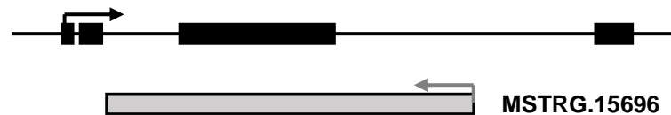
Figure S2. Structure of genes and their paired NATs. Black and gray boxes represent the exon regions of the genes and NATs, respectively. Arrows represent the direction of transcription.