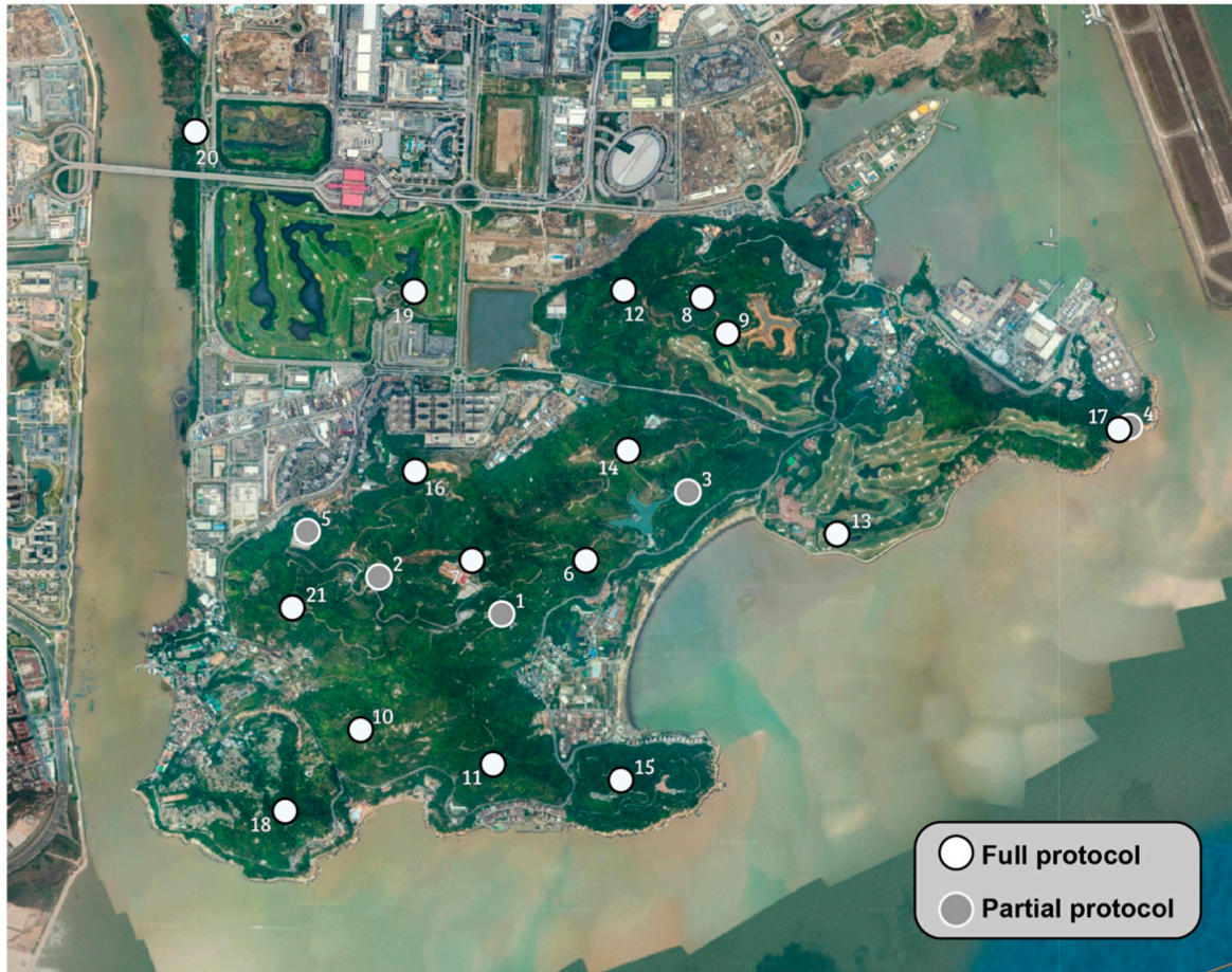
Figure S1. Map of Coloane showing the 21 sites sampled in the 2019 survey. White dots mark sites where the full protocol was performed (i.e., standardized and species pool leaf litter extractions, ground baiting, ground nests, subterranean traps, and arboreal traps), whereas grey dots mark preliminary sites where only ground baiting and leaf litter extractions were performed. Hand collection was also opportunistically used at each site.