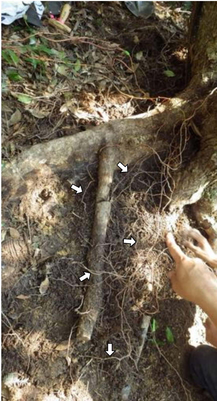
Figure S4 Underground root system of Erythrorchis altissima . White arrows show the roots of E. altissima .