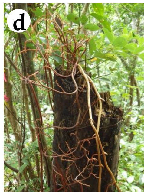
Figure S1 Erythrorchis altissima (a) study site and (b) fruits. (c) Stems climbing on living tree and (d) standing dead wood.