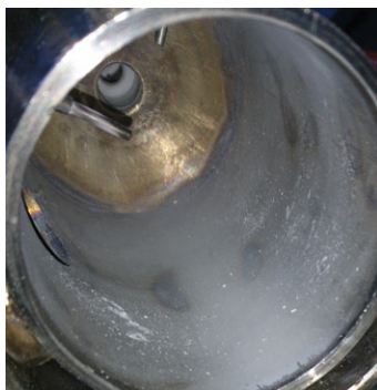
Figure S2. Combustion chamber after test.