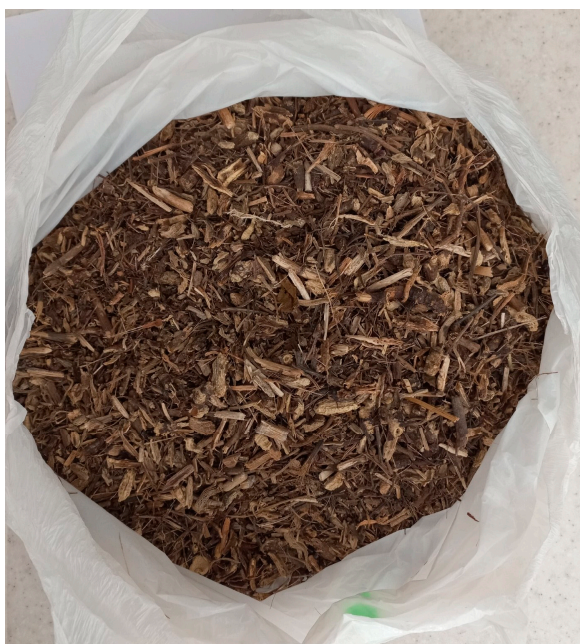
Figure S1. Picture of the plant material ( Echinacea root) used for extraction in this study.

* Correspondence: manol.ognyanov@orgchm.bas.bg; Tel.: +359-32-642759