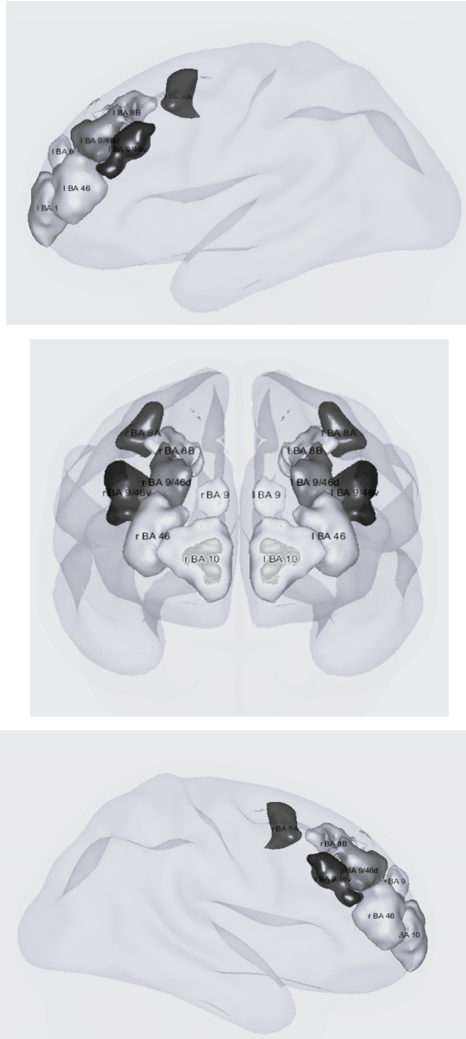
Figure S1. Prefrontal cortex based on the Sallet Atlas (Sallet et al. 2013). Seven dorsolateral prefrontal cortex sub-regions used in our analyses, corresponding to: brodmann area (BA) 9, BA 10, BA 9/46D and BA 9/46V, BA 46, BA 8A and BA 8B.