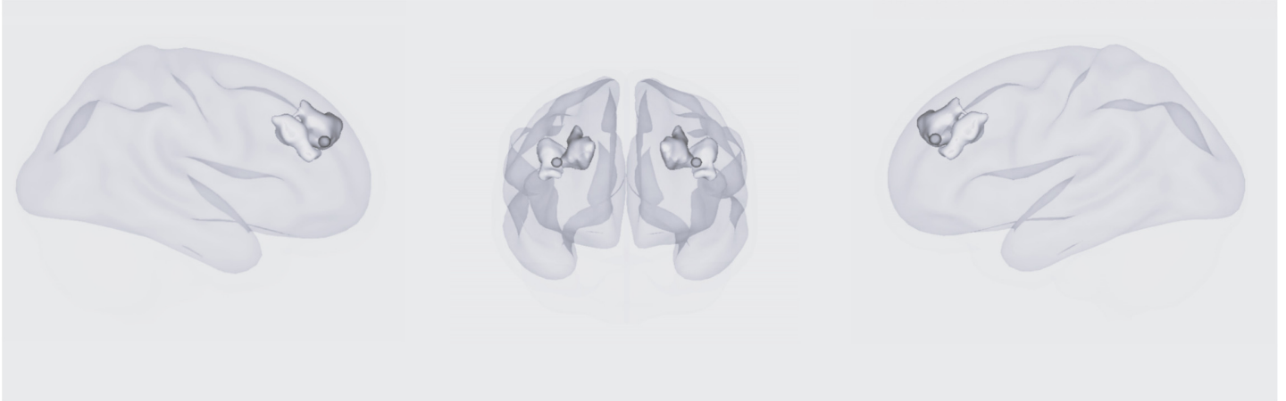
Figure S2. Neuronavigated coordinates overlapping Brodmann areas 9/46D and 9/46V.

Neuronavigated coordinates were based on the MNI152 stereotaxic atlas (coordinates, -38, +44, +26 and +38, +44, +26). Note: The circular areas correspond to the left and right MNI coordinates (targeted DLPFC), while the light gray corresponds to the BA 9/46V region and the dark gray corresponds to the BA 9/46D region.