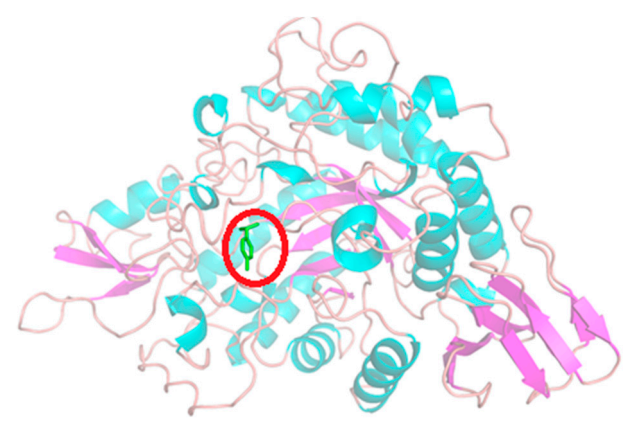
Figure S5. Molecular docking pattern of \alpha -glucosidase and terpinene