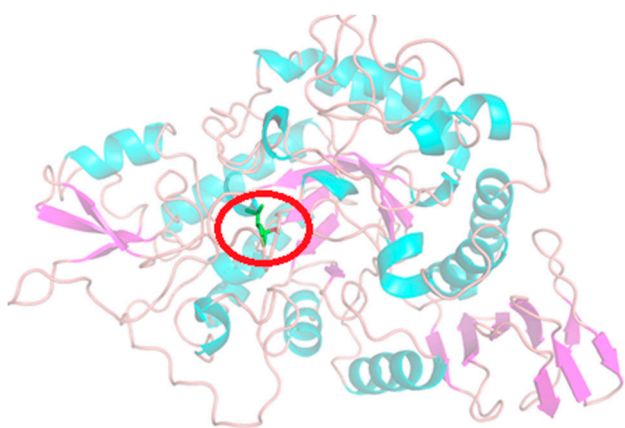
Figure S3. Molecular docking pattern of \alpha -glucosidase and terpineol.