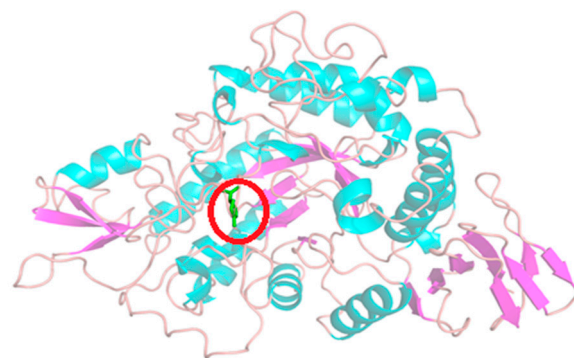
Figure S2. Molecular docking pattern of \alpha -glucosidase and limonene.