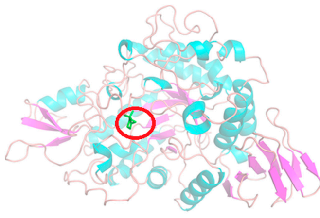
Figure S4. Molecular docking pattern of \alpha -glucosidase and \beta -pinene.