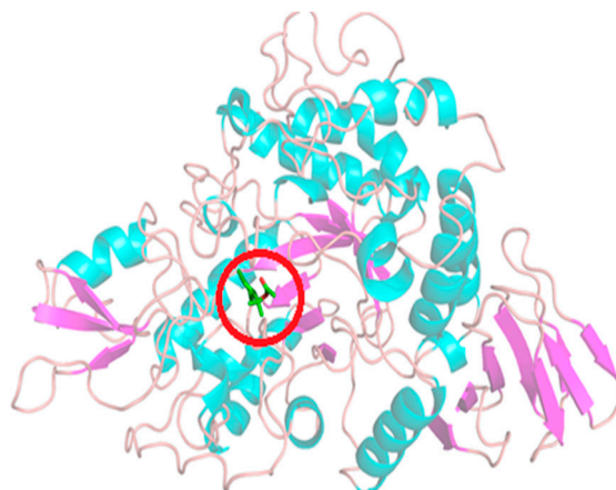
Figure S6. Molecular docking pattern of \alpha -glucosidase and terpineol acetate