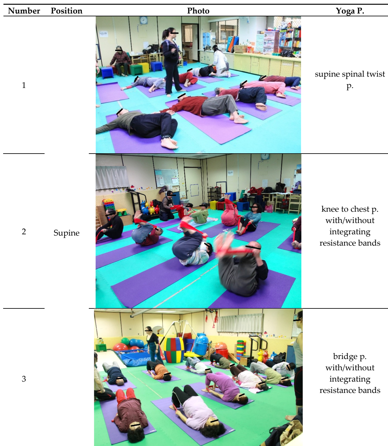
Table S3. Yoga pose.

See below for a further detailed description of Yoga class schedule and each position.