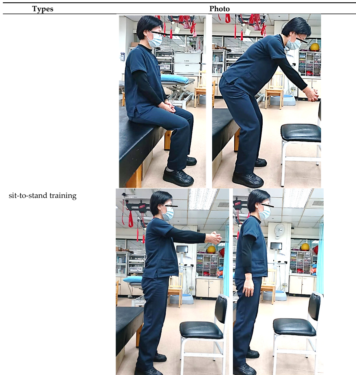
Table S1. Standard stroke rehabilitation.