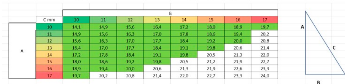
Table of correspondence between cathetus distances (A & B) and hypotenuse distance C

Supplement S3: Tumours with a length <10 mm could be readily covered with simple triangular shapes.