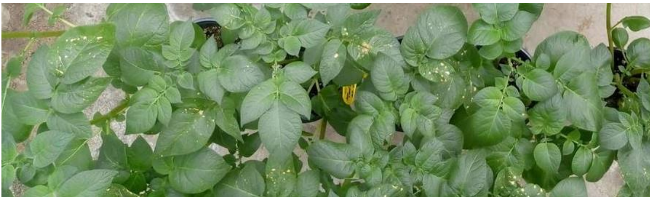
Figure 1. Potato plants, seven days after spraying with a solution of essential oil at a concentration of 10 \mu\text{l/mL}

The results of the phytotoxic test of essential oil on potato plants showed that the vitality of the plants was not disturbed, but a few leaves with white spots (chlorosis) were observed (Figure 2). Synowiec et al. [15] show that some crops may be more resistant to the toxic effects of essential oils than selected weeds.