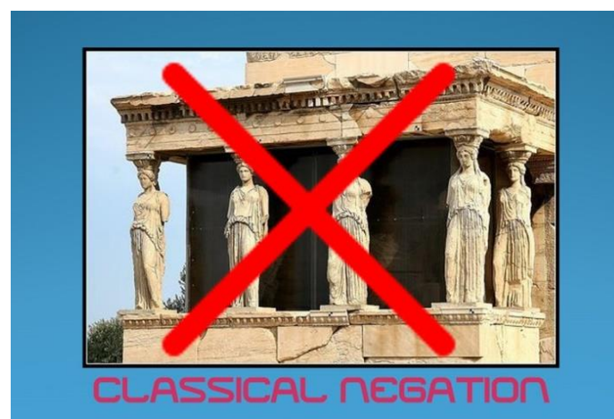
Figure 1. Classical negation is not classic.

The opposition between classical logic(s) and non-classical logic(s) has been challenged in different ways at the philosophical and mathematical levels. At the philosophical level, the adjective “classical” is quite ambiguous, as is the opposite adjective “non-classical” facing it. Classical propositional logic is not classical in the sense of something related to the classics of Greek antiquity (Figure 1) nor in the sense of classical music or classical physics [21,22] 4 . The term rather means “orthodox”. Francisco Miró Quesada (1918–2019) [23] preferred the dichotomy orthodox/heterodox , Susan Haack used the dichotomy deviation/extension [24], Lloyd Humberstone introduced the notion of “contra-classical logic” [25], and there is also “anti-classical logic” [26]. There are many different ways to describe and understand the universe of logic systems.