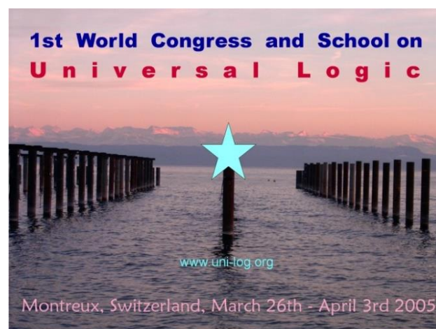
Figure 2. The first UNIOLOG.

A series of events was launched in 2005 in Montreux, Switzerland, called UNIOLOG: Word Congress and School on Universal Logic (Figure 2) [45].