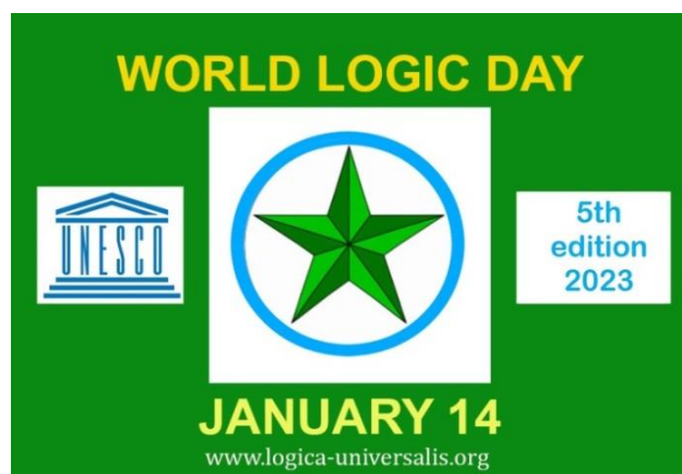
Figure 3. The fifth edition of World Logic Day.

In the sixth edition (Vichy, 2018), the universal logic contest took the shape of a World Logic Prizes Contest , in which winners of contests from different countries competed, universality being then about the unification of logic research worldwide [46,47]. In this same spirit, the Logica Universalis Association (LUA) launched on 14 January 2019 the first World Logic Day [48], which was recognized the same year unanimously by the general UNESCO assembly [49] and which since 2020 has been part of the calendar of international days of UNESCO (Figure 3).