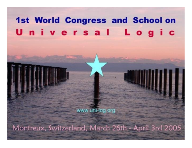
Figure 2. The first UNILOG.

A series of events was launched in 2005 in Montreux, Switzerland, called UNILOG: Word Congress and School on Universal Logic (Figure 2) [45].