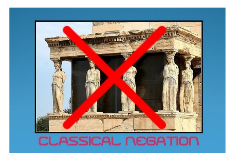
Figure 1. Classical negation is not classic.

The opposition between classical logic(s) and non-classical logic(s) has been challenged in different ways at the philosophical and mathematical levels. At the philosophical level, the adjective "classical" is quite ambiguous, as is the opposite adjective "non-classical" facing it. Classical propositional logic is not classical in the sense of something related to the classics of Greek antiquity (Figure 1) nor in the sense of classical music or classical physics [21,22]<sup>4</sup>. The term rather means "orthodox". Francisco Miró Quesada (1918–2019) [23] preferred the dichotomy orthodox/heterodox , Susan Haack used the dichotomy deviation/extension [24], Lloyd Humberstone introduced the notion of "contra-classical logic" [25], and there is also "anti-classical logic" [26]. There are many different ways to describe and understand the universe of logic systems.