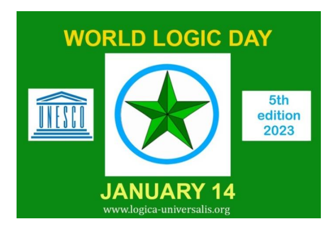
Figure 3. The fifth edition of World Logic Day.

In the sixth edition (Vichy, 2018), the universal logic contest took the shape of a World Logic Prizes Contest , in which winners of contests from different countries competed, universality being then about the unification of logic research worldwide [46,47]. In this same spirit, the Logica Universalis Association (LUA) launched on 14 January 2019 the first World Logic Day [48], which was recognized the same year unanimously by the general UNESCO assembly [49] and which since 2020 has been part of the calendar of international days of UNESCO (Figure 3).