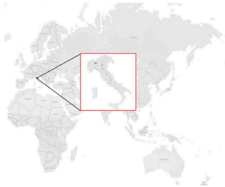
Figure 1. Geographic distribution of participants in Italy.

Formula 1 shows the Pearson's Coefficient Correlation. The correlation coefficient is determined by dividing the covariance by the product of two variables' (survey questions) standard deviations.