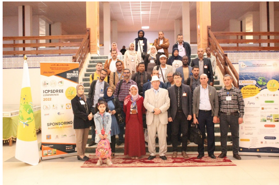
Figure 2. ICPSDREE 2022 participants.

Australia, the USA, and France), one guest speaker, three invited speakers, and one hundred talks in oral sessions.