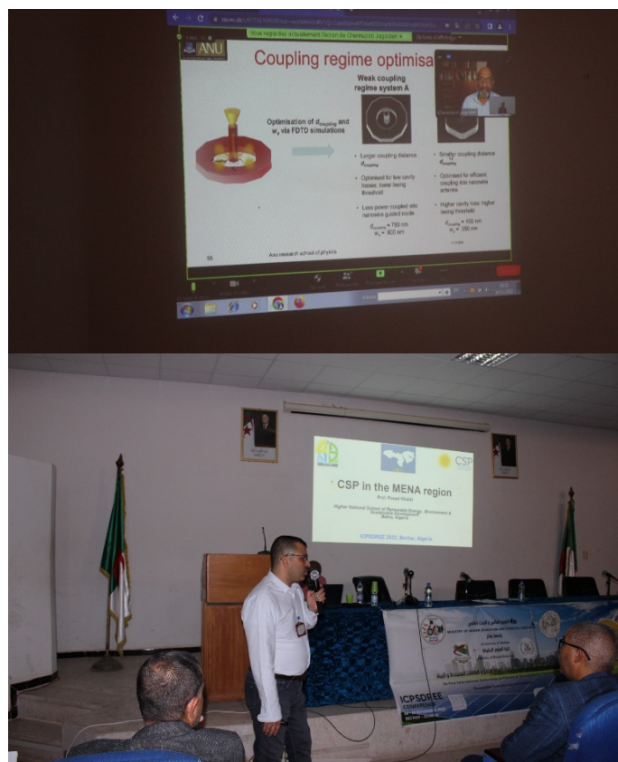
Figure 1. ICPSDREE 2022 Bechar, Algeria.

The University of Bechar, Algeria, held an international conference on physics, renewable energies, and environment (ICPSDREE) from 14 to 16 November 2022. Professors and researchers from various countries attended ICPSDREE 2022, both virtually and in-person. The conference included four regular sessions and one special session, which were organized as follows: physics of semiconductor devices; renewable energies; environment; heat flow and matter transfer (Figure 1).