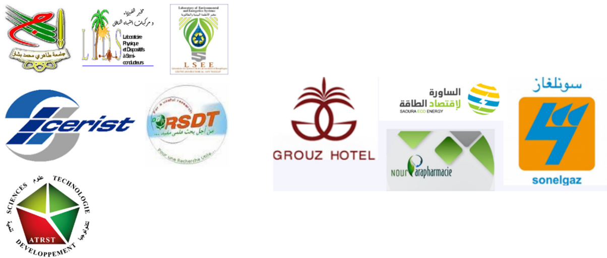
Figure 4. ICPSDREE sponsors.

Conflicts of Interest: The authors declare no conflict of interest.