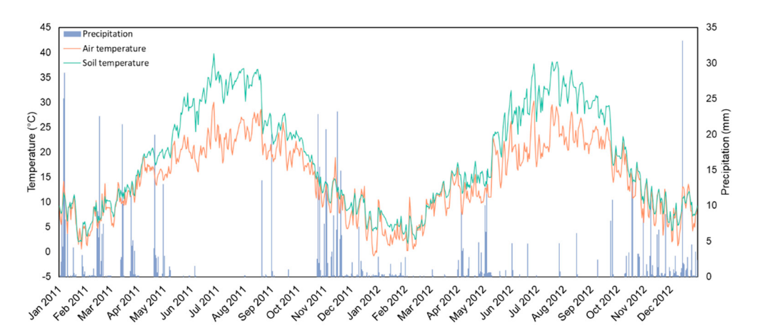
Figure 2. Daily precipitation (mm) and mean air and soil temperature ( {}^{\circ} C) recorded at the meteorological station located in the study area, during the study period.