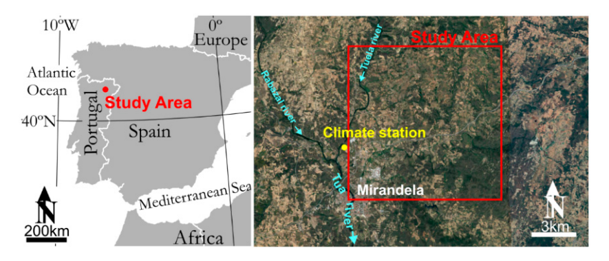
Figure 1. Location of the study area © Google Earth.

The study area (Figure 1) consists of a square 10 km² landscape window, located in the northeast of Portugal. The climate is temperate with rainy winters and hot and dry summers, according to the Köppen classification [5]. Daily records of air temperature, soil temperature and precipitation measured during the study period (2011 and 2012) at the meteorological station operated by the Instituto Português do Mar e da Atmosfera (IPMA), represented by a yellow circle in Figure 1, are shown in Figure 2. Land cover consists mainly of olive orchards, temporary crops and pastures. Forests also represent an important part of the land cover in the study area, mostly in the southeastern region. Urban areas are less represented, with a part of the city of Mirandela appearing in the southwestern corner of the study area.