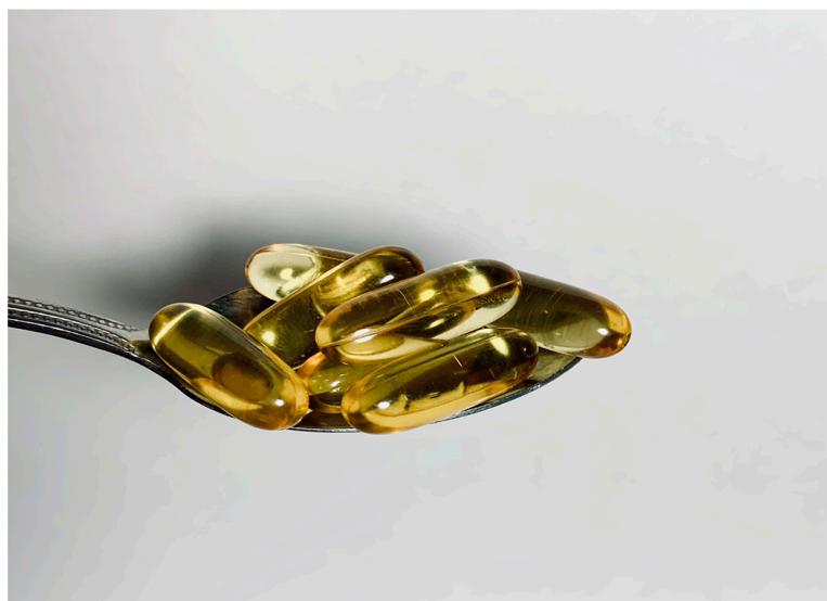
Figure 1. Vitamin D.