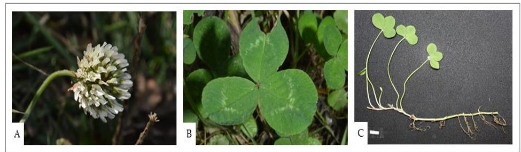
Figure 2. Trifolium repens in Itatiaia National Park. (A) Inflorescence; (B) leaf composed of three leaflets, and (C) stolon.