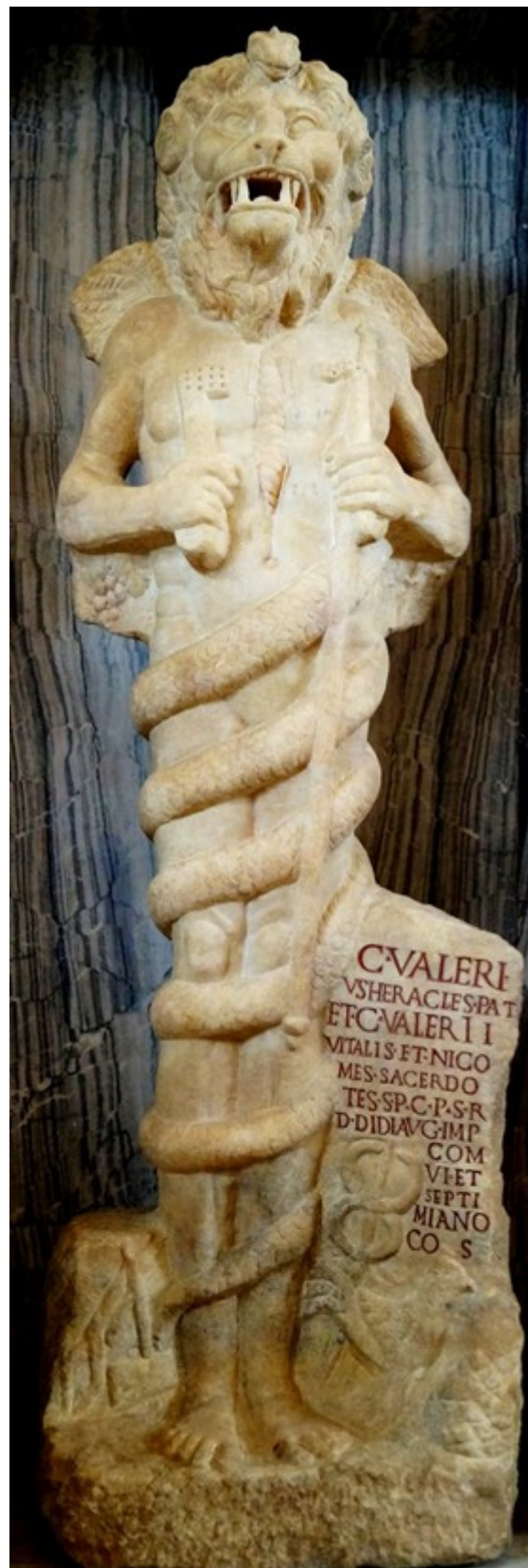
Figure 2. Leontocephaline, marble statue, H. 160 cm, Br. 52 cm, from Mithraeum in Ostia, biblioteca in the Vatican Museum (190 C.E.).