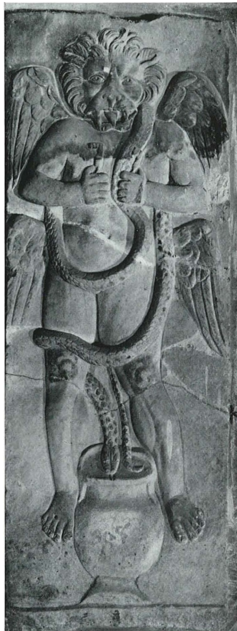
Figure 7. Leontocephaline, marble relief, H. 107 cm, Br. 40 cm, D. 2.5 cm, found in the Mithraeum in Ostia, Museum Chiaramonti XIV, 3, Vatican museum, Rome (2–3 century C.E.).