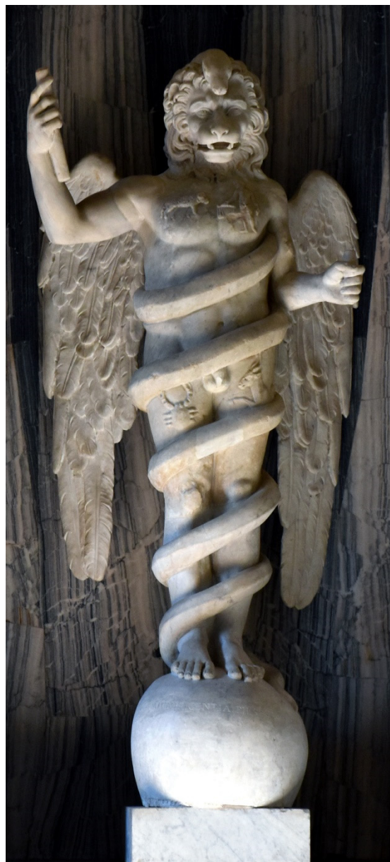
Figure 1. Leontocephaline from Villa Albani, white marble statue, H. 155 cm, Br. 37 cm (base), Vatican Museum, Rome (190–225 C.E.).

The positioning of the hands, the Romanized style, and the reliefs on the torso and hips, alongside conceptual ideas embedded in the statue, are deviations from the leontocephaline prototype and testify to its adaptation to Roman artistic tendencies and preferences. These changes are suggestive of Eastern and Western entanglement of religio-philosophical concepts that merge into a syncretic image, adjusted to Roman concepts and esthetic values [9].