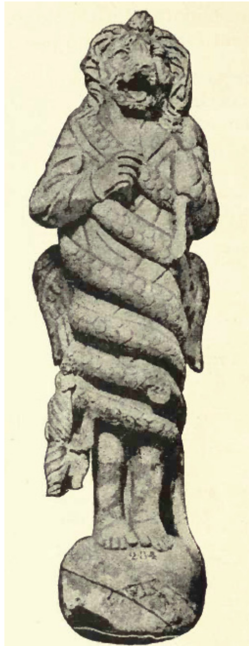
Figure 9. Leontocephaline, white marble relief, H. 115 cm, Br. 35 cm, from the Galleria degli Uffizi (2–4 century C.E.).

art, or was delivered from outside the Capitol, having been made in the periphery. In any event, zodiac signs are common features of the Leontocephaline prototype to indicate the movement of time, such as the Barberini Fresco (Figure 3) in which the Leontocephaline stands on a globe between a strip of zodiac signs, or the Leontocephaline from the Galleria degli Uffizi (Figure 9) that has a similar strip on the globe on which it stands. The zodiac cycle is typically an attribute of Aion and stresses that aspect of the Leontocephaline and its iconology of time. However, the specific choice of these signs and the specific order in which they appear alludes to a different time system.