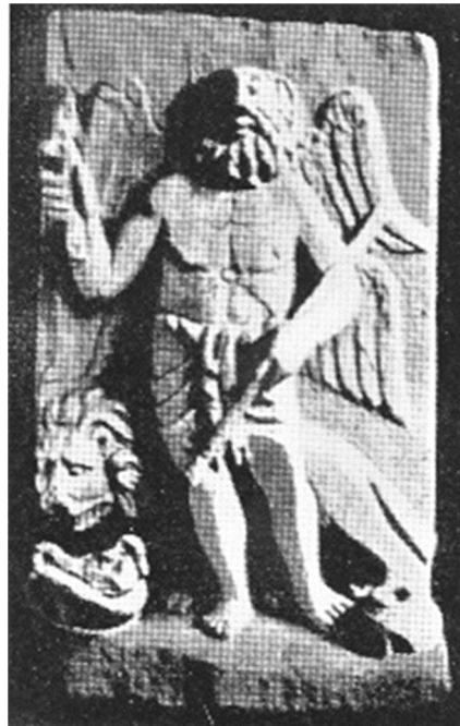
Figure 11. Aion, sandstone relief, H. 65 cm, Br. 41.5 cm, D. 16 cm, found in Argentoratum in Upper Germany, Archaeological Museum, Strasbourg (3–4 century C.E.).

This aspect of the importance of the lion and the lion's mouth is also evident in the Aion from Strasbourg relief (Figure 11) that depicts a bearded Aion, which Levi sees as bordering between the youthful Aion and Saturn. Behind the figure, a lion stoops over a vase enwrapped by a serpent [30] (pp. 283–284). The lion's mouth is prominent, stressing that the soul that rises from the vase (matter) reaches the lion mouth. Roman sarcophagi regularly exhibit lions' heads with open mouths in the corners, which might indicate a similar symbolism to that of the Leontocephaline. I agree with the scholarly consensus that the lion/Leo and its jaws are a crucially important symbol representing a sphere where the transformation of the soul occurs after death.