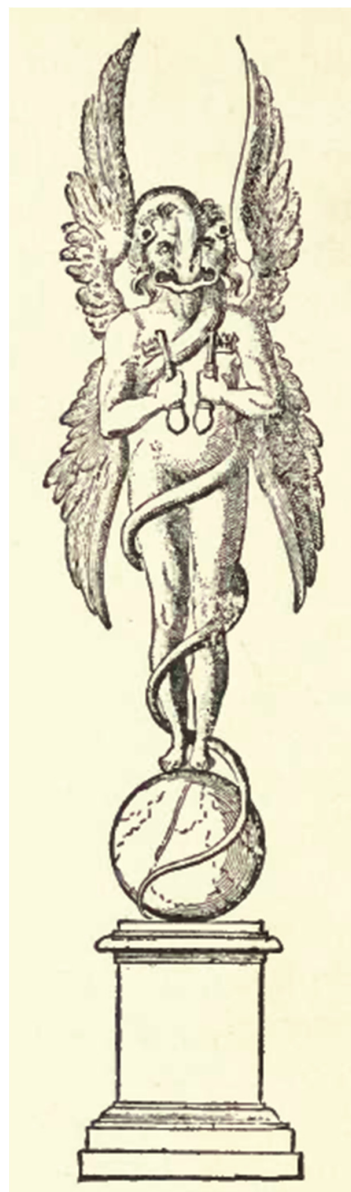
Figure 10. Leontocephaline, sketched by Bartoli from a description found in a Mithraeum, Rome (16 century C.E.).

This unique iconography indicates an artistic awareness of these aspects, as a visual debate on the progress of the soul after death, reincarnation, and salvation. The movement of the serpent on the naked human body of Saturn indicates the chronological time system. Its ascent from matter indicates death and the release of the soul from matter. The coiled movement of the serpent symbolizes the movement of the soul upward toward the heavens and the cycle of time and passing of the seasons. As the serpent moves upward it travels between the constellations, rising from Capricorn till it reaches Leo, where its transformation occurs. The wonderful thing about a serpent's movement is that it is limbless, so the same movement can also indicate the descent into matter. It returns through the gate of Cancer and regains material form in its descent to earth. The serpent on the head of the lion emphasizes the metamorphoses, which gains further emphasis in a Renaissance sketch of a statue that has not endured, in which the serpent is clearly shown in the lion's mouth (Figure 10) [23] (pp. 32–34).