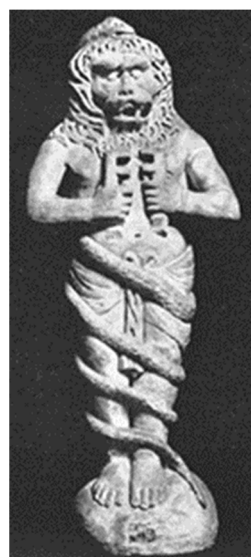
Figure 5. Leontocephaline, white marble statue, H. 79 cm, Br. 20 cm (base), from Muti's gardens near Villa Ludovisi, Lateran Museum, Rome, No. 318A (3–4 century C.E.).