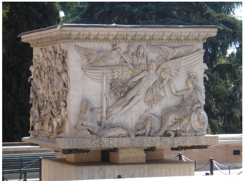
Figure 12. The apotheosis of Antoninus Pius and his Wife Faustina, marble high relief on the pedestal of Antoninus Pius's column, Field of Mars, Rome (c. 161 C.E.).

feathers are realistic and elaborate, reduced to two wings to adjust its image to that of Aion's as he is presented in the pedestal of Antoninus Pius's column (Figure 12) as a human with two proportionately large wings open to either side. In contrast, the Leontocephalines from the Mithraeum in Ostia (Figures 2 and 7), which although probably made in Rome, have a more Eastern orientalism esthetic approach that stresses the origin of the type as distant from the center of Rome [58]. The Leontocephaline from the Villa Albani is in alignment with the Roman stylistic genre, with ambiguous attributes that leave only minor hints as to its Eastern origins. The Eastern ideas that remained had already been accepted by the Roman elite. This statue is the culmination of the appropriation process of the Leontocephaline type, as it was absorbed, processed, and transformed for the Roman elite.