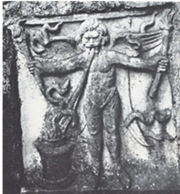
Figure 6. Leontocephaline, white marble relief, H. 75 cm, Br. 65 cm, from the stairs leading to the garden of Palazzo Colonna, Roma (2–4 century C.E.).

A vase that probably contained water was found in the Mithraeum of the Seven Spheres. It is encircled by a serpent and engraved with the constellations. Richard Gordon maintains its iconography symbolizes the soul's elevation to higher spheres [33]. Joanna Bird suggests that a similar vase adorned with tiny images of a serpent and a lion is evidence that members of the cult from the lion grade of initiation (one of seven) oversaw the lighting of the liturgical incense [34]. Some vases with serpents on them have holes and were probably illuminated by fire from the inside. She finds that the Leontocephaline prototype iconographic formulas are connotated with the notion of serpents and vases as containers of the soul. One example of this is the Leontocephaline relief from the Mithraeum in Ostia (Figure 7). Gordon maintains that the vase symbolizes the confining vessel for the soul; its opening, like the lion's mouth, is the gate through which the soul passes in order to be released from its materialistic constraints and transported to other spheres.