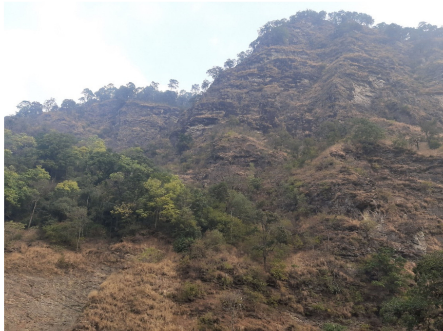
Figure 3. Photo showing sleep trees used by golden langurs and the steep nature of the terrain in Bhutan.

One of us (RG) is a forester who has been based in Langthel subdistrict for 10 years and is familiar with the distribution of golden langurs in the subdistrict. Prior to in-depth observation, three authors (KD, LS, and RG) explored the study area and located 24 golden langur groups (9 in BC and 15 near HS). We assigned a unique identifier to each langur group that indicated whether it was inside a BC or near a HS. The terrain in Bhutan is rugged and steep, especially in forested regions (Figure 3). We chose these groups to observe because RG already knew their approximate ranges and locations, and we could see them along roads or by viewing them through a spotting scope positioned on the opposite mountain.