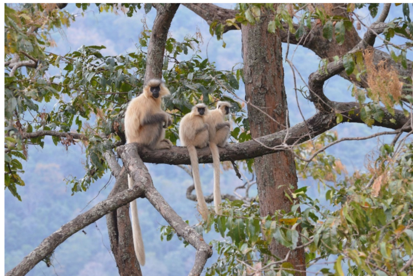
Figure 1. Golden langur group members basking in the sun.

Habitats and associated dispersal options influence golden langurs' group sizes, densities, and compositions [12]. Golden langurs have been observed living in uni-male/multi-female groups of 3–9 individuals, bi-male/multi-female groups of 8–15 individuals, and multi-male/multi-female groups of varying sizes [2] (Figure 1). All-male bands of two to five individuals and solo males have also been reported [2]. The uni-male/multi-female social structure is considered to be the most common and stable group formation [12,13]. In a study based at Royal Manas National Park (Zhemgang, Bhutan), researchers documented an overall average group size of 7.14 individuals, and 78% of groups observed were uni-male/multi-female [4]. Shil and colleagues [12] found significant differences in golden langur average group sizes at forest-core, forest-edge, and plantation sites in Assam, with the largest groups (average of 13.9 individuals) in plantations. In human-altered habitats, langurs live in larger groups with higher densities [12,14]. For example, we observed a group of 25 golden langurs ranging near a hydroelectric dam construction site in Trongsa district, Bhutan. Anthropogenic environments can alter the environment in ways that influence dispersal from birth groups and that increase mortality risks from injuries due to electrocution, car collisions, and domestic dogs [6,12].