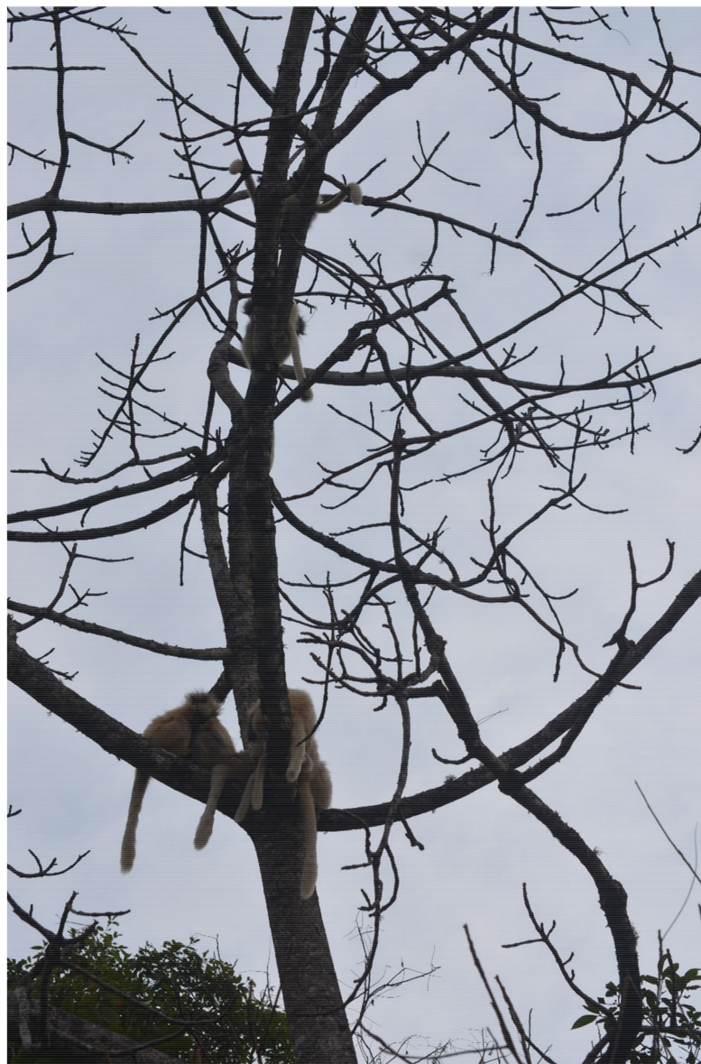
Figure 4. Photo showing golden langur group members in a sleep tree.

Using GPS, we recorded the latitude and longitude of sleep sites and feeding trees. For each sleep tree, we recorded species, girth (DBH), height, crown cover, and connectivity (Figure 4; Table 1). We classified the shape of each sleep tree into one of seven shape categories and classified the slope gradient of the ground surrounding each sleep site into one of four categories. We measured each sleep site's aspect counterclockwise from 0 to 360 degrees.