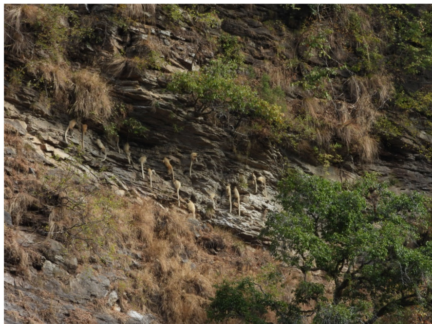
Figure 6. Photo showing golden langurs at a mineral lick site.

In addition to death due to predation, golden langurs living near people experience mortality due to electrocution on power lines and vehicle collisions [6], which increases the costs golden langurs experience from living near people [39]. We observed both causes of mortality during the short duration of our study. If this mortality is biased toward a particular sex or age class, it could contribute to the differences observed in the group composition of langurs living in anthropic versus less disturbed habitats. In Trongsa district, golden langurs are often spotted on or near roadways, and they sometimes cross roads on the ground when the canopy is bisected by a roadway. At higher elevations, the use of salt to melt roadway ice attracts grey langurs ( Semnopithecus schistaceus ) to the road as a salt lick, and at lower altitudes, such as our study site, on cool or cold days,