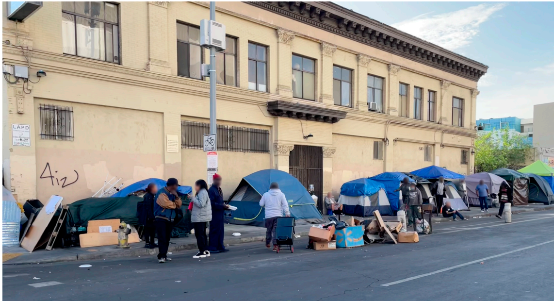
Figure 1. Homeless tents in Skid Row—image by the author.

substantially decreasing the overall number of homeless individuals [5–7]. This has led to a complicated and often contested landscape, where the goals of urban development and real estate interests clash with the basic needs and rights of the homeless population.