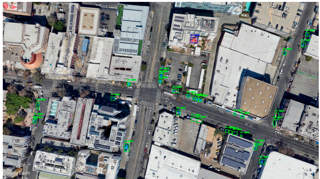
Figure 3. Capturing homeless tent locations using Tensorflow Object Detection API—image by the author.

With a refined model, we processed extensive maps encompassing Skid Row, extracting tent coordinates to construct a dynamic visual narrative of the decade's spatial transformations. This digital cartography serves not only as a historical record, but also as a basis for correlative analysis with ancillary data streams—such as the evolution of municipal resources for the homeless, the enforcement of urban policies, and their spatial ramifications.