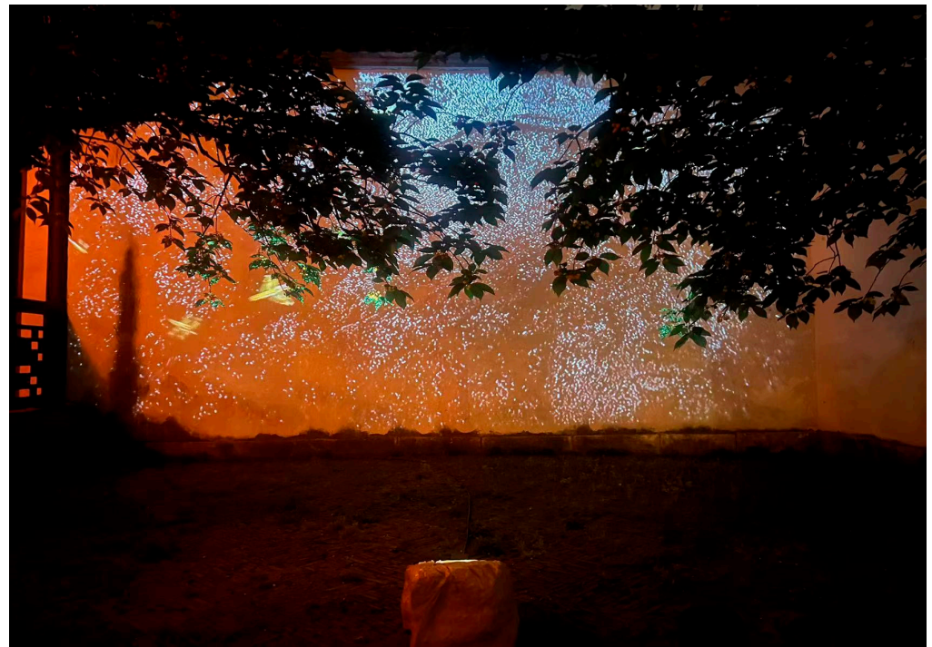
Figure 4. ‘Sitting with the Cherry Trees’. Designed scenes in the Li Residence represent historical garden living and portray architecture as the agency of viewing. (Source: Image provided by the HAG Management Office). Permission of use granted.