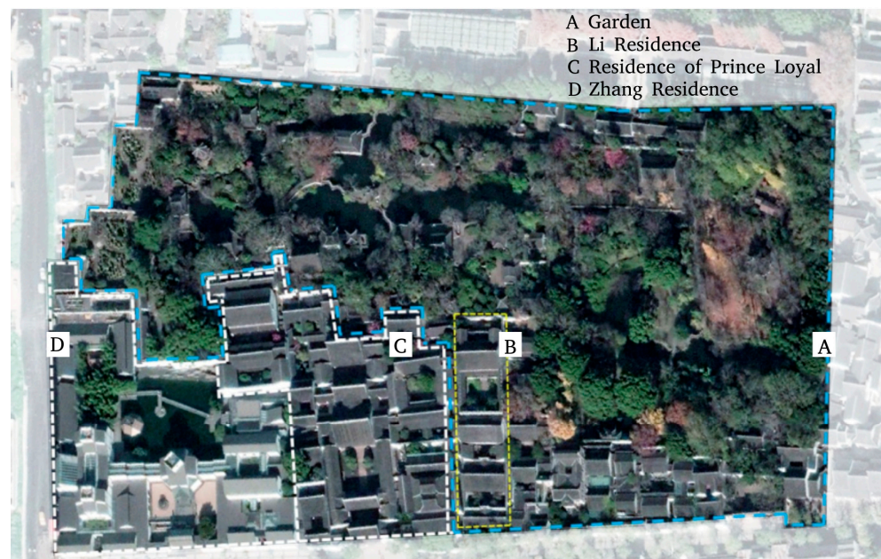
Figure 2. The Humble Administrator's Garden as of 2022. This unity of architecture and landscape involves the garden in the north and architecture complexes in the south.

complexes towards the south of the garden were divided into three parts. These were known as, in order from east to west: the Li Residence; the Residence of Prince Loyal; and the Zhang Residence. Each of these three complexes covers an area of approximately 2400 square meters, 7700 square meters, and 8000 square meters, respectively (Figure 2).