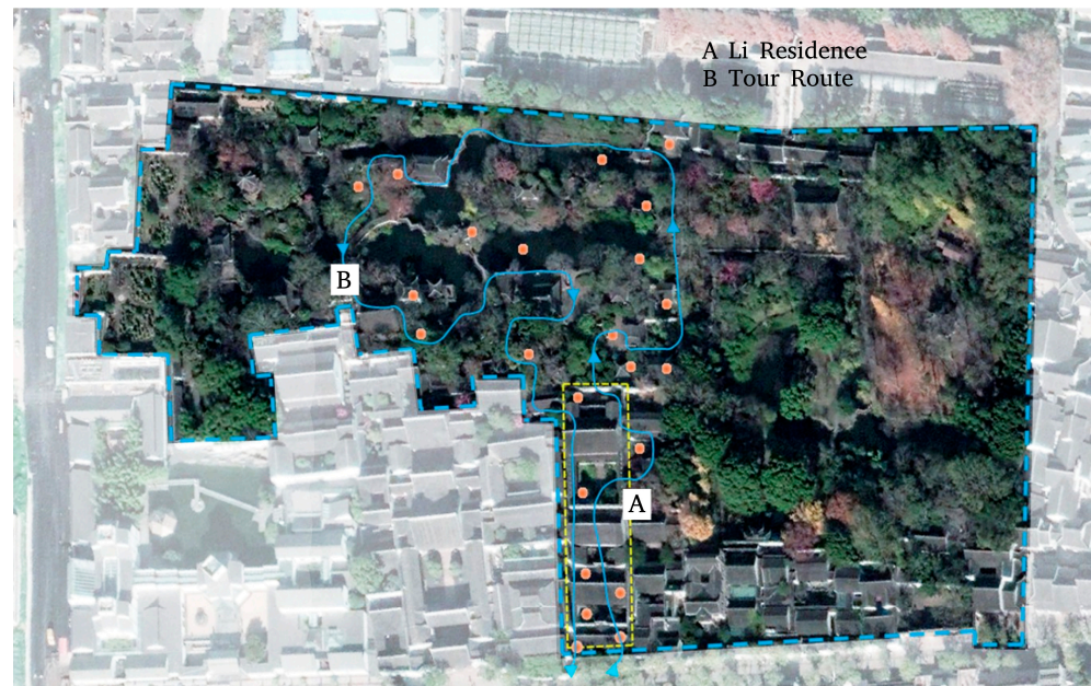
Figure 3. The notion of walking is guided and framed along the Li Residence’s central axis northwards until entering the garden. Blue line and arrows indicate the route. (Source: author re-drawing of an image provided by the HAG Management Office).

architecture and landscape is diluted in the tour. This is represented by, for instance, the imitations of scholarly activities that are centered around the notion of viewing. Building components—including walls, beams, and decorative elements—are used as part of the display to facilitate immersive multimedia experiences that depict garden life scenes (Figure 4).