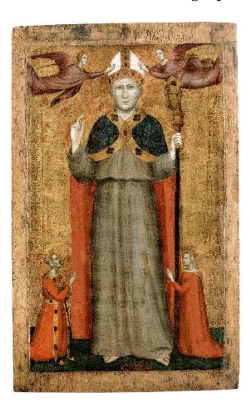
Figure 3. Master of Giovanni Barrile, Saint Louis of Toulouse worshipped by Robert of Anjou and Sancia of Majorca , painting on wooden panel, 1330–1336. Aix-en-Provence, Musée Granet. Image published in [12] (Figure 11).

prayers of the friars of the convent towards the Saint in favour of the royal couple. In this sense, the panel played a role in the religious and liturgical activities of the church (for more details and bibliographic references about this interpretation, see [12] (pp. 130–136)).