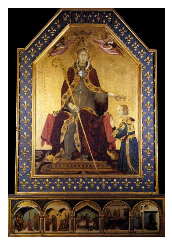
Figure 2. Simone Martini, Saint Louis of Toulouse crowning King Robert of Anjou , painting on wood, 1317–1319. Naples, Museo di Capodimonte.

two angels are crowning him and, in turn, he is crowning his younger brother. Robert is devoutly kneeling at his feet and he wears ceremonial robes and a sort of pallium, both richly decorated and embroidered with the coats of arms of Anjou and Jerusalem. If the face of Louis, in the frontal position, is rather stereotyped, the face of Robert, in profile position, is considered one of the first examples of a portrait in medieval art and, as said, it follows the real appearance of the King. Precious gems and goldsmith works directly embedded in the wooden panel decorate the whole composition. In the underlying predella, there are five episodes of Louis' life taken from the texts of his canonisation process. From left to right, they are as follows: the election as bishop by Pope Boniface VIII; the taking of the Franciscan habit and the consequent acceptance of the bishopric of Toulouse; Louis in the act of serving at the table; Louis' death; and his post-mortem miracle (regarding the scenes in the predella, see [19]).