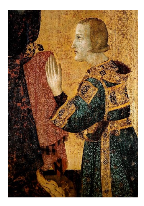
Figure 1. Simone Martini, Saint Louis of Toulouse crowning King Robert of Anjou , painting on wood, 1317–1319. Naples, Museo di Capodimonte. Detail of Robert's face.

In the second group, instead, are representations connected with religious and devotional contexts and associated, so to speak, with the private sphere and the personal practices of Robert. They represent the Angevin as a devotee (face in profile, kneeling position, small size, and proximity to religious subjects) while he carries out liturgical activities and devotional acts. What is more, they render, following the report on the bones of the King by the Istituto di Anatomia Umana Normale dell'Università di Napoli in June 1959 (see [11] (pp. 40–42)), his real physical features: light brown hair that falls straight down to the neck and concludes with a rather tight curl; shaved, thin, and oblong face; protruding and pointed chin; accentuated jaw; thin lips; pronounced nose; narrow eyes that, as well as the cheeks, are rather sunken and that highlight the cheekbones; high and spacious forehead; and deep wrinkles around the nose and mouth (Figure 1). This entry focuses on this second group of images. In particular, they are the following four artworks: Simone Martini's altarpiece, the Master of Giovanni Barrile's panel, the Master of the Franciscan tempera's canvas, and the so-called Lello da Orvieto's fresco (regarding the identification of Robert of Anjou's official image, see [12] (pp. 97-110), with more information and bibliographic references).