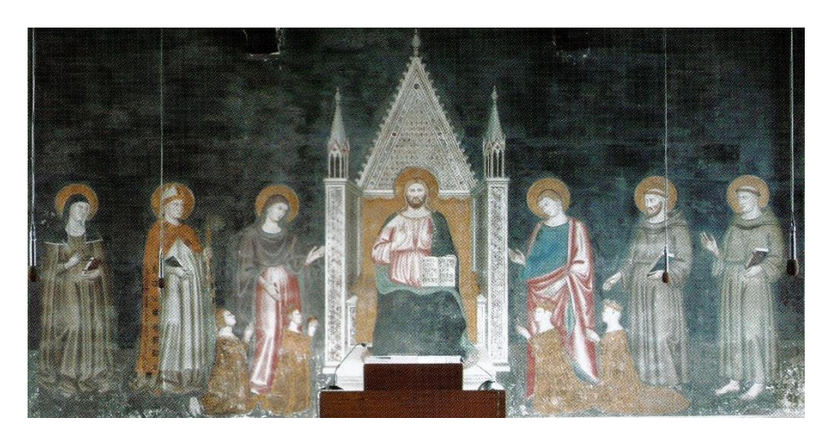
Figure 5. The so-called Lello da Orvieto, Christ enthroned between saints and Angevin royals , fresco, 1336–1337. Naples, Monastery of Santa Chiara, former male chapter house. Image published in: [12] (Figure 16).

depicted bearing a crown on her head) and her husband Andrew of Hungary. Robert, as usual, is wearing a golden ceremonial robe dotted with lily flowers and a sort of pallium and bearing a lily crown. The King's face has the aforementioned physiognomic features, although he is rendered in a slightly different and more idealised way. At the least, his appearance seems more youthful, although the fresco dates after the previous images (but, maybe it suffered some remaking).