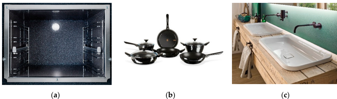
Figure 3. Modern examples of enamel application objects: (a) Enameled pyrolytic oven of a modern wood stove; (b) Enameled cookware set; (c) Enameled bathroom washbasin.

The reader should now be able to understand the potential application of enamel coatings. Figure 3 shows some examples of modern enameled samples.