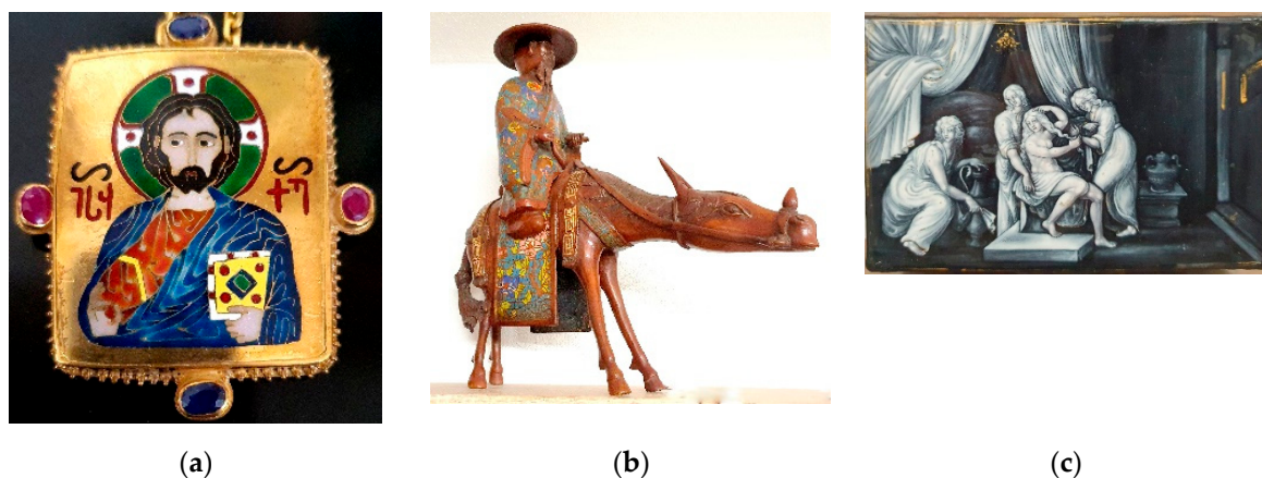
Figure 1. Examples of decorative enameled objects preserved and exhibited at the ARtCHIVIO museum in Ponte San Pietro (BG), Italy: (a) cloisonné enamel on gold icon in byzantine style, end of 20th century; (b) Champlevé enamel on bronze two-pieces statue, end of 19th century; (c) Enamel paint representing “Psyche’s toilet” by Jules Sarlandie, end of 19th century.