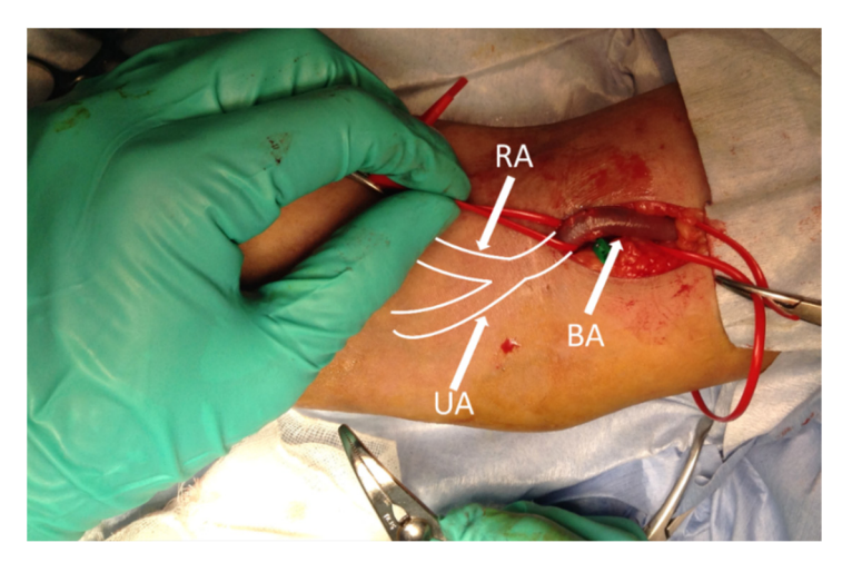
Figure 2. Operative site, just above the brachial artery thrombus: BA, brachial artery; RA, radial artery; UA, ulnar artery.

duplex ultrasonography. The patient was discharged from hospital on the same day of the procedure.